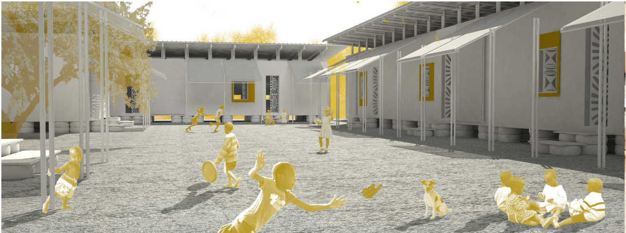
9. Rendering of the orphanage

essential to have the right contacts to find the best suppliers and workers. But the major problems seem to be cultural and systemic: The chaotic situation of the country and the wide use of concrete currently prevent a building system that uses natural materials. A step in the right direction might be to train a group of workers to use straw-bales in construction. This might happen in the occasion of the foyer at St.-Marc, in case this project is transformed into reality.