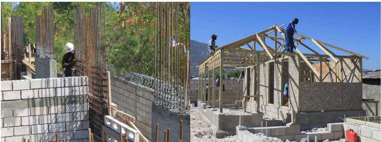
1. Usual reinforced concrete system and CRAterre system

Some NGOs have proposed new building systems that use an alternative materials instead of concrete. For example, CRAterre has built earthquake-resistant timber-frame buildings, with debris as infill. This new construction system is taught to workers on building sites. However, buildings making without concrete are mostly experimental (Fig. 1).