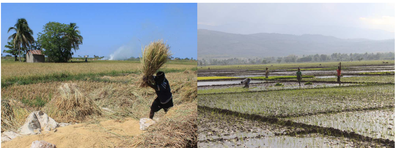
3. Artibonite valley

Anyhow, to build safely with straw bales, moisture inside them should be less than 15%. [8]