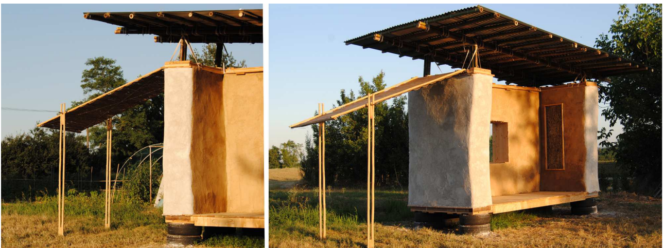
8. Final Prototype, movable shade