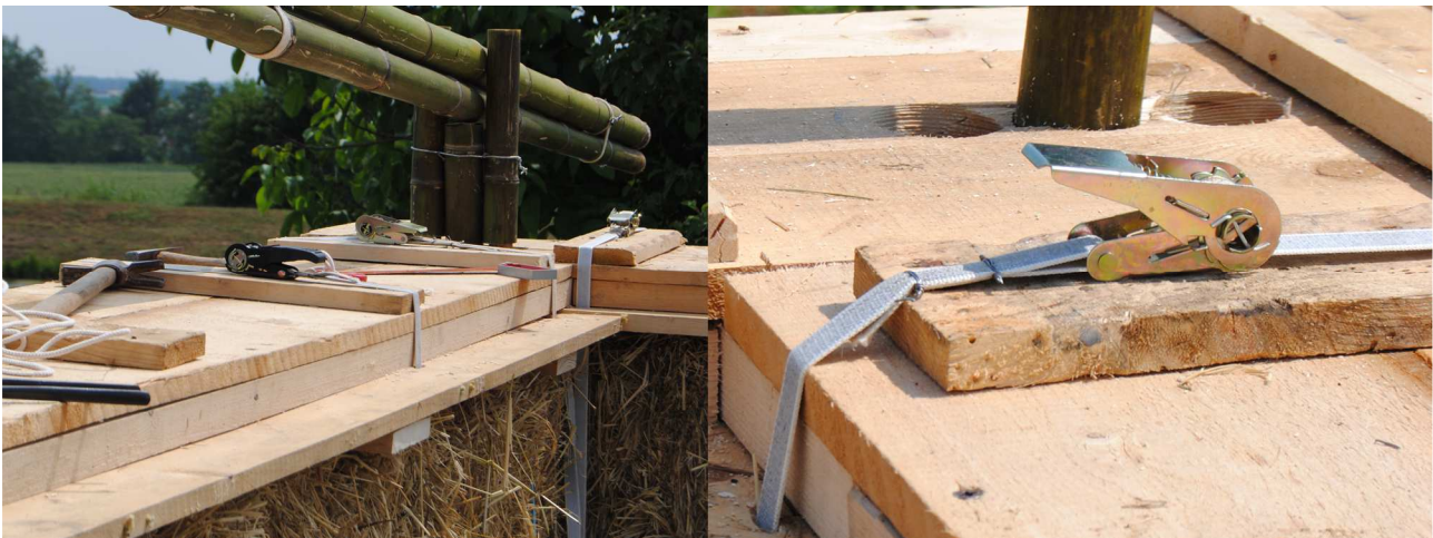
6. Wooden structure at the top of straw bales walls

This distributes all over the wall the pressure exerted by 8 polyethylene straps that connect the bottom with the top beams. A ratchet allows to tension the belts which pre-compress the walls. In this way, the solidity of the structure is greatly increased. The height of the straw bale walls was reduced by almost 10 cm. After the construction of the walls we started to assemble the roof-supporting system. This structure was built entirely with struts and beams made of bamboo with mechanical joints. First, four pillars were constructed: each element consisted of three bamboo poles.