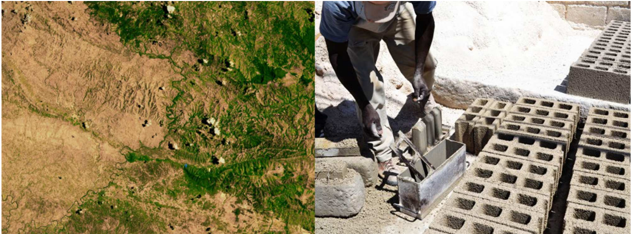
2. The boundary between Haiti and the Dominican Republic shows the high deforestation. On the right the production of cement blocks

Other local materials such as limestone and clay can be found in abundance, but their use was lost and has been replaced by cement mortars. Moreover, the gradual deforestation has generated serious problems of soil erosion that has made the majority of lime sediments collapse. Haiti is mostly mountainous so local stone is largely available. But this stone is geologically very young and therefore brittle.