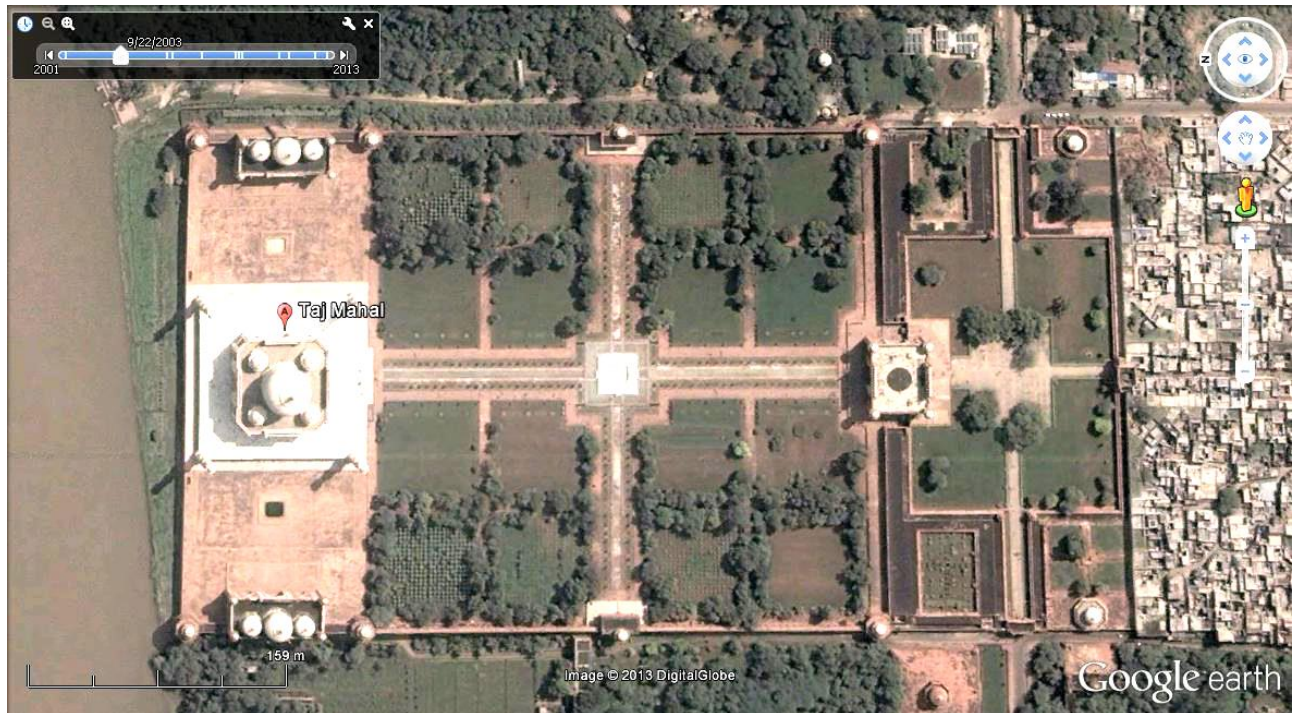
Figure 2 – The Taj Mahal Gardens. Note that the image is rotated: the mausoleum, gardens and gateway are aligned in the North-South cardinal direction.

According to Ref.10, most Mughal charbaghs are rectangular with a tomb or pavilion in the center. The Taj Mahal garden is unusual because its main element, the white Mausoleum, is located at the end of the garden. This fact created a debate amongst scholars regarding the reasons why the traditional charbagh form had not been used. Ebba Koch suggests that a variant of the charbagh was employed; that of the more secular waterfront garden found in Agra, adapted for a religious purpose [10,14]. However, after the discovery of the Moonlight Garden, on the other side of the River Yamuna, the Archaeological Survey of India proposed that the Yamuna itself was incorporated into the planning of Taj Mahal, to be seen as one of the rivers of Paradise. In this case, the Taj Mahal complex, as shown in the Figure 1, becomes the traditional charbagh [10].