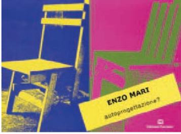
FIG. 4. DISOBEYING SOCIO-ECONOMIC RULES: CONTEXT (ENZO MARI IS AUTHOR OF THE BOOK AUTOPROGETTAZIONE? PUBLISHED BY CORRAINI, MANTOVA, IN 2002).