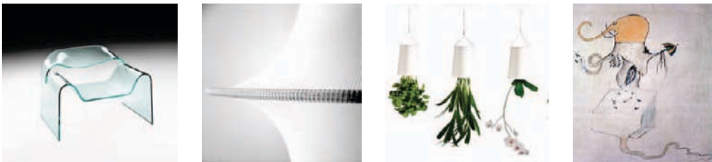
FIG. 3. DISOBEYING TECHNICAL-FUNCTIONAL RULES: FROM LEFT MATERIALS (GHOST ARMCHAIR BY CINI BOERI AND TOMU KATAYANAGI, PRODUCED BY FIAM ITALIA, 1987 AND FALKLAND LAMP BY BRUNO MUNARI, PRODUCED BY DANESE, 1964), GRAVITY (SKY PLANTER DESIGNED BY PATRICK MORRIS, PRODUCED BY BOSKKE, 2008), LINEARITY OF THE PROCESS (“CADAVRE EXQUIS” BY MAN RAY, JOAN MIRÓ, MAX MORISE AND YVES TANGUY).

In this area we have i.e., relatively to the dimension of the object, the transgression of the ergonomic rules (design out of scale, change of proportion...), of the use of material (iper-materialization vs annulations of matter, sinesthesia...) or of the function (transforming, deleting or substituting components, working against gravity...). At the dimension of the process, i.e., we can fragment the process (an historical example is Cadavre exquis , a collective creative drawing technique used by Man Ray, Joan Miró, Max Morise and Yves Tanguy, where everybody makes his own piece attached to the others but seeing only the final portion of the previous work), or invert the linearity of the process itself (i.e starting from the end).