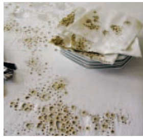
FIG. 5. DISOBEYING AESTHETICAL RULES: SEMANTIC VALUES (MEZZADRO BY ACHILLE AND PIER GIACOMO CASTIGLIONI, DESIGNED IN 1957 AND PRODUCED BY ZANOTTA IN 1971), PERFECTION (COFFEE AND CIGARETTE BY JULIE KRAKOWSKI, AUTOPRODUCTION, 2006).