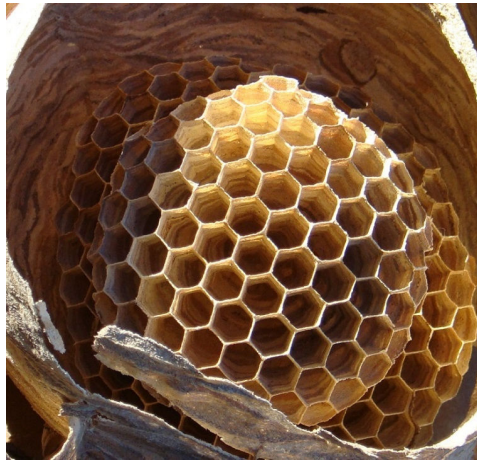
Fig.1 A natural honeycomb structure, a nest of wasps made of paper

Honeycomb structures have a high strength-to-weight ratio. Natural or man-made, these structures minimize the amount of used material to reach minimal weight and minimal material cost. As previously told, a man-made honeycomb structures is usually a lattice of hollow cells between thin walls that provide strength in tension, in a plate-like shape. Natural honeycomb structures include beehives made of wax and nest of wasp made of paper. Probably it was the hexagonal lattice created by honey-bees, a structure admired from ancient times, which suggested Euclid the hexagonal shape as making the most efficient use of space and building materials.