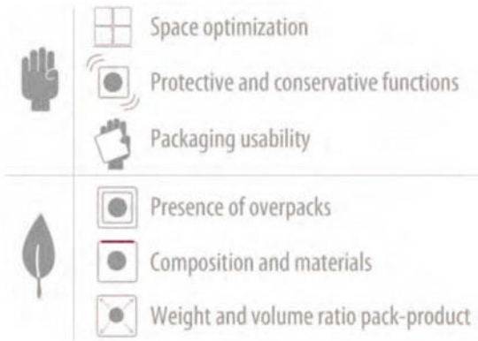
FIG. 1. EXAMPLE OF EVALUATION ICONS AND THEIR MEANINGS.

In the wake of environmental legislation and consumer demand for more environmentally friendly sales packaging many companies will be forced into a position of redesigning their packages. When it comes to this redesign, or developing a new sales package altogether, environmentally friendly packaging may offer a competitive advantage.