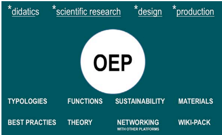
FIG. 3. ORGANIZATION OF OEP

Besides the criteria, underlying concepts and principles, most discussions towards achieving goals for sustainable packaging are focused on details of models and practices adopted by the industry, and the effectiveness and practicality of these practices in balancing the economic profits and environmental benefits.