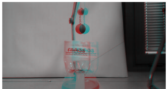
Fig. 1. Stereoscopic view captured from the 3D smartphone during a test. Rendered as a red-cyan anaglyph for printing only.

The following hardware components, shown in Fig. 2, have been selected for the implementation. (1) 3D smartphone . We used an HTC Evo 3D with a 5 megapixel stereoscopic autofocus camera, an 1.2 GHz dual core Qualcomm Snapdragon (ARmV7) processor, 1 GB of RAM memory and WiFi b/g/n support. The OS used for the software development was Android 2.3 Gingerbread with Linux kernel version 2.6.35.13 release htc-kernel@amd18-2. (2) Wireless access point . We used a Linksys WRT54GL WiFi router with 802.11