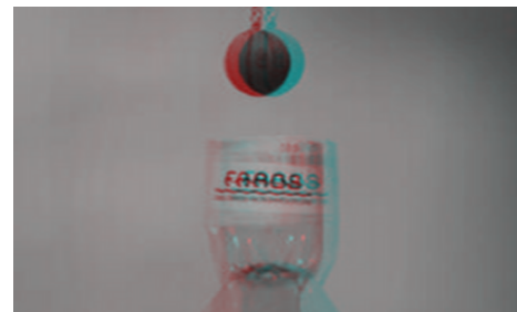
Fig. 1. Sample video scene captured by the stereoscopic video system. Rendered as a red-cyan anaglyph for printing only.

The software has been developed ad hoc for this particular setup with the primary aim to minimize latency. Although the hardware capabilities allowed to capture images with 1280 \times 720 resolution in stereoscopic mode, an acceptable latency could be achieved with our setup only when the resolution was equal or lower than 640 \times 360 . More technically, the transmitter part relies on the primitives provided by the Android OS, and video compression routines have been written in native code to improve performance. The receiver software runs on a desktop PC with Linux OS, equipped with the Nvidia 3D vision kit and a graphics hardware supporting OpenGL with the stereoscopic capability.