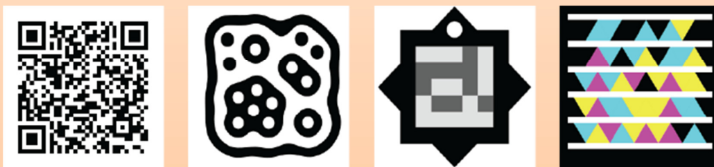
Figure 1. Different types of visual markers

Vision-based localization systems rely either on natural image features ([3]) or on visual markers, also called fiducials. Natural image features are edges, colour regions or local image descriptors, mathematical entities providing a characterization of the image region surrounding a point of interest that is invariant to image transformations such as rotation, scaling and illumination changes. The use of natural features requires solving various problems. First, as a pre-processing stage, it entails building a visual map of the environment, which relates features extracted from images to their exact spatial location. This step is complex and time-consuming, and requires updating the visual map at every change in appearance of the environment. Second, natural feature matching requires a huge computational power and it is, therefore, unfeasible on most off-the-shelf devices. To soften the problem, the feature extraction and matching process can be simplified, with a consequent precision loss. Another possible solution is the processing of the images through a remote server, increasing the time required to obtain the positional data and involving privacy issues related to transmitting and storing images potentially portraying individuals inside the environments.