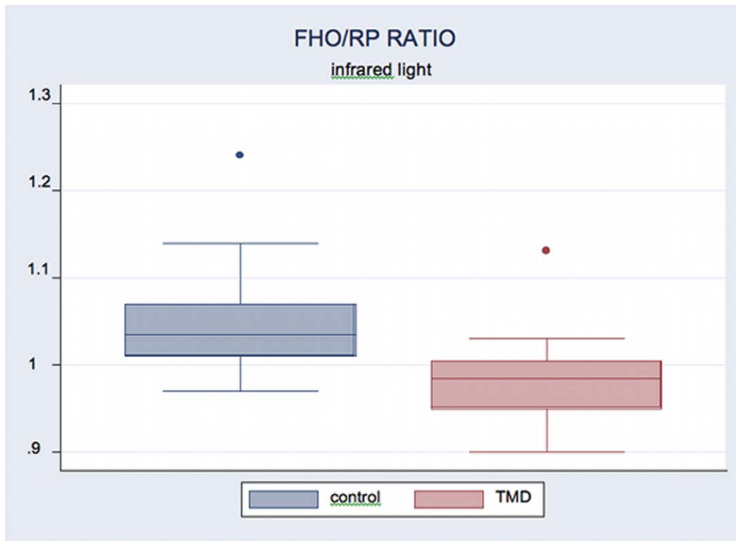
Figure 1. Box plot of FHO/RP ratio in infrared light condition. doi:10.1371/journal.pone.0045424.g001