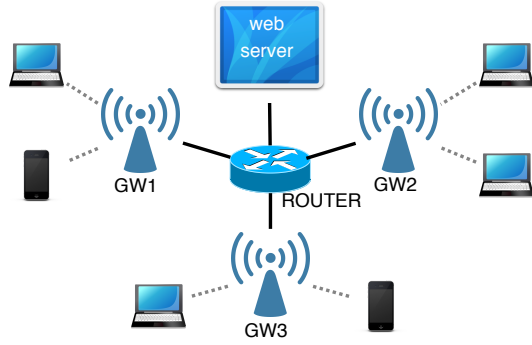
Figure 1. Testbed architecture.

to any GW. We included four laptops and two smart-phones as WSs, so as to create the heterogeneity of a real-life residential environment.