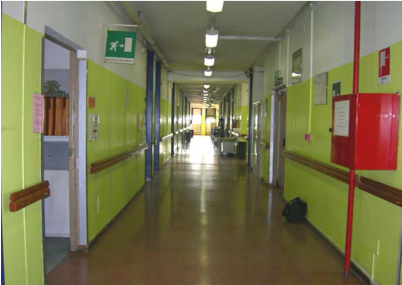
Fig. 3: The corridor of the department of Medical Oncology 2 San Lazzaro University Hospital San Giovanni Battista in Turin before the restyling of colour.