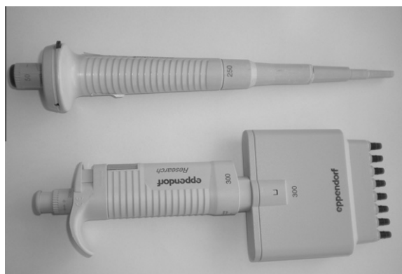
Fig. 1. The multichannel pipette (bottom) was substituted by the single pipette (top) to improve the method.

ric measurements. In particular, a strong criticality was highlighted in the values during STEP 3, exhibiting an increase of the dispersion of results (but for Ca and Bs ). Another problem is due to the tendency shown by many microorganisms to have an absorbance value near zero at STEP 5, requiring remedial action. Since STEP 3 is the most critical phase, an improvement in the method of washing was devised, by a closer control of pipette tip during the insertion into the wells and a softer release of the washing liquid (PBS). To achieve these objectives, a single pipette tip was adopted, avoiding the use of the multichannel pipette (Fig. 1), thus enabling the operator to improve control during washing phases (STEP 3 and before STEP 4).