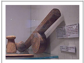
Fig.1 The label is telling that the object is the case of a balance scale (Egyptian Museum, Torino)

Cliccare sull'immagine per l'ingrandimento