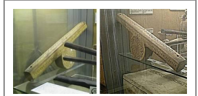
Fig.2 In a previous preparation of the items found in the Kha's Tomb at the Egyptian Museum, it was possible to see the front and back of the object. They are the same.