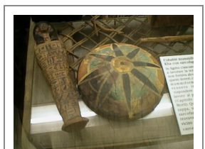
Fig.4 A "rose of direction", from the Kha's Tomb.