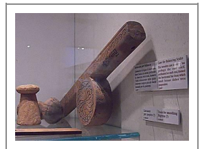
Fig.1 The label is telling that the object is the case of a balance scale (Egyptian Museum, Torino)

Cliccare sull'immagine per l'ingrandimento