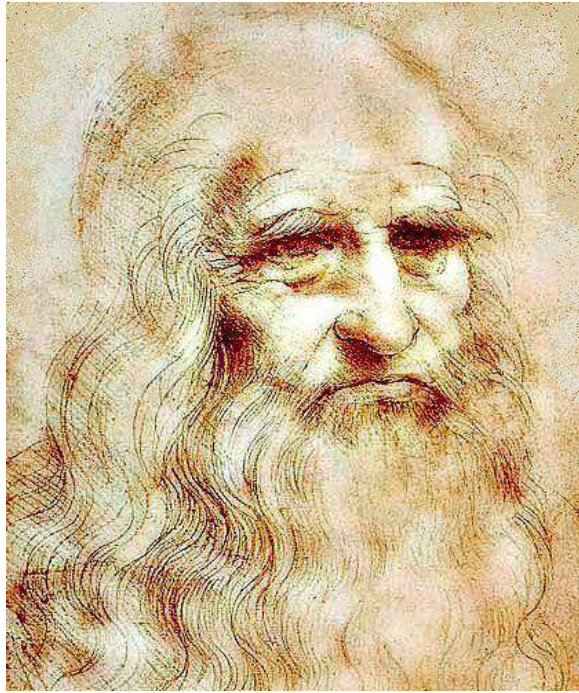
Fig.1 Leonardo da Vinci self-portrait in red chalk, held at the Biblioteca Reale of Turin