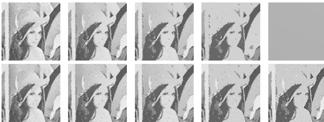
Fig. 3. Top: Perona-Malik model. Bottom: Polynomial CNN. From left to right: Output images at the scales t = 0.1 , t = 1 , t = 10 , t = 100 and t = 500 .

static images. Table I presents the SNR values evaluated at the scales corresponding to the images shown in Fig. 3.