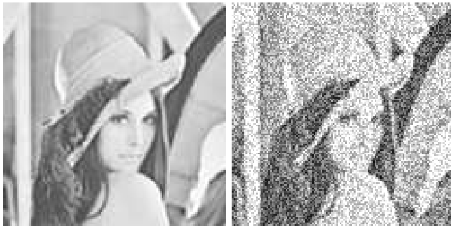
Fig. 2. Left: Original Image, Right: Image with Noise.