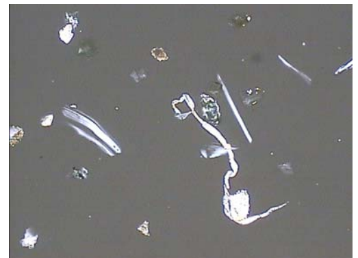
Photo 3. 200 – 400 mesh class. Chrysotile tufts and an organic fibre (at the centre and below). Short side of the photogram 0,94 mm.