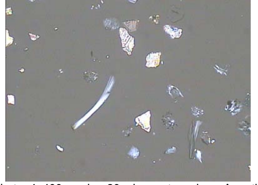
Photo 4. 400 mesh - 20 micrometers class. A partly frayed chrysotile tuft. Short side of the photogram 0,47 mm.