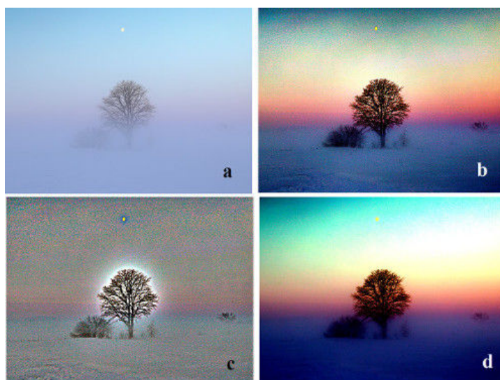
Figure 1 – Panel (a) is showing the original image. The other three images are giving the outputs after GIMP Retinex filtering (scale:240, scale division:3, dynamic:1,2). In (b) the level is uniform, in (c) low and in (d) high. Note the enhancement of the visibility of the objects, which are present in the image. In (b) and (c) we have also a strong enhancement of colors.

The two proposed examples, and several others we have tested, are showing that it could be interesting to investigate, in more detail and quantitatively, the role of GIMP Retinex filtering in determining the best threshold for an image segmentation. This could be relevant for those applications, which are devoted to the enhancement of foggy images. The combined use of a Retinex method and thresholding had already demonstrated to work well for optical character recognition systems and document analysis [21].