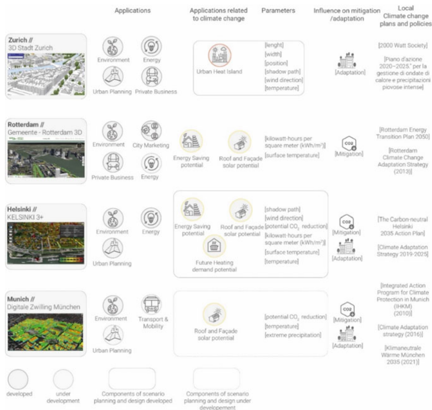
Fig. 55.2 Analysis of urban digital twin to support climate change scenario planning and design.

In the future, UDT could be the right platform to collect, elaborate, and visualize the results of the combination of different indicators to assess the possible mitigation and adaptation design measures could be implemented for buildings and open air spaces regeneration. This perspective required more studies in order to choose design measures and relative indicators, adequate parametric digital tools to simulate each indicator, right aggregation of different indicators, and rules to make results interoperable with UDT.