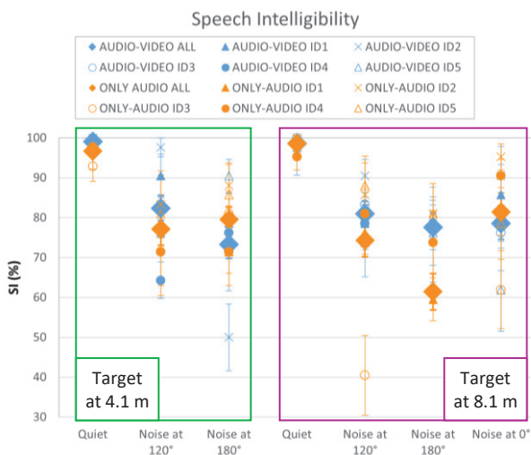
Figure 3. Average and standard error of the SI scores for all 7 scenes in case of AV and only audio test conditions for all subjects and for each single subject. Note that the mean distance from the 2 loudspeakers is considered as target distance.

Fig. 3 shows the SI percentage outcomes from the ecological tests for all 7 scenes and for both AV and only audio test conditions.