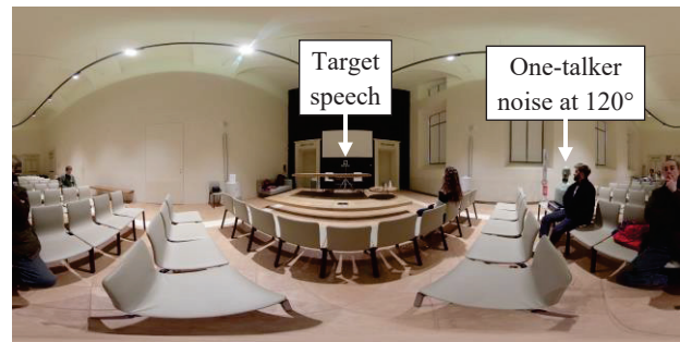
Figure 2. Example of equirectangular video preview for scene 2 (target at 4.1 m, noise at 120° azimuth).

the NTi Audio XL2 calibrated omnidirectional class-1 sound level meter was used as a receiver, placed in different positions of the audience. T_{20} was computed as the spatial average across 5 receiver positions starting from RIRs. The obtained T_{20} value averaged from 250 kHz to 2 kHz equals 3.2 s (standard deviation equal to 0.5 s), about 2 s more than the optimal value ( 1 \text{ s} \pm 0.2 \text{ s} ) according to [21]. Moreover, the STIPA was measured in the two listening positions (L1 and L2) with the proper signal emitted from the Talkbox (70 dBA @ 1m) and amplified by the room loudspeakers. The corresponding global A-weighted sound pressure level of the STIPA signal (called L_{Aeq} signal) was also measured in both the listening positions in order to keep the same target speech level value during the SI test. At last, also the background noise level ( L_{Aeq} quiet) was measured. Tab.2 reports STIPA and L_{Aeq} values with the corresponding optimal values from [21].