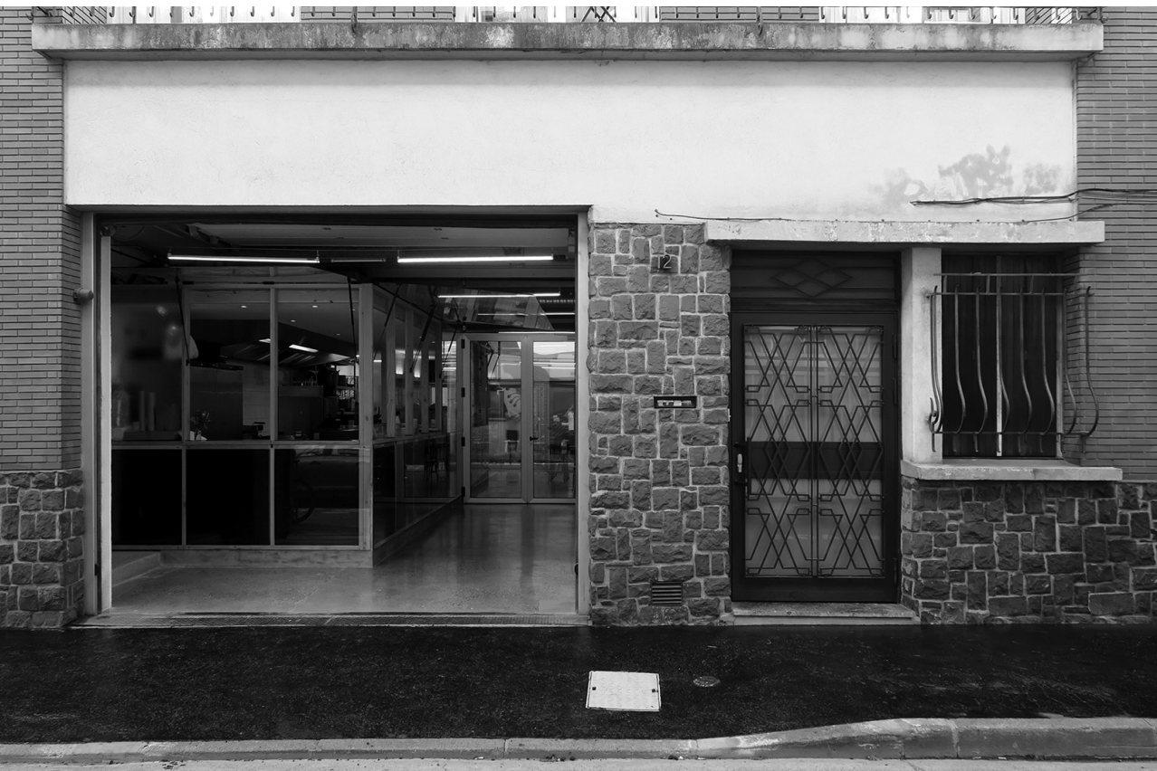
Fig. 3 - The vestibule of the T15 project is divided from the dining room by the interposition of a glass partition and by the kitchen block.

It also refers to an immaterial understanding of comfort, primarily the result of cultural constructs and personal habits.