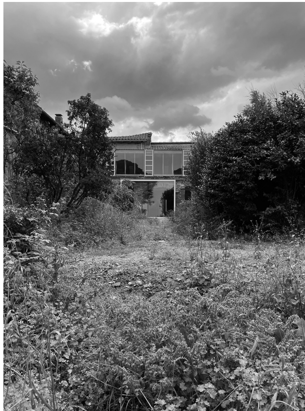
Fig. 5 - The garden and the north façade of the E54 project in Montjoire, characterised by a shed roof over the original masonry wall.

The continuity of the concrete floor ensures a smooth transition between the different spaces. The in-between theme is often adopted by BAST and it allows them to rearticulate the threshold concept, creating with a minimal budget different levels of thermal comfort and privacy.