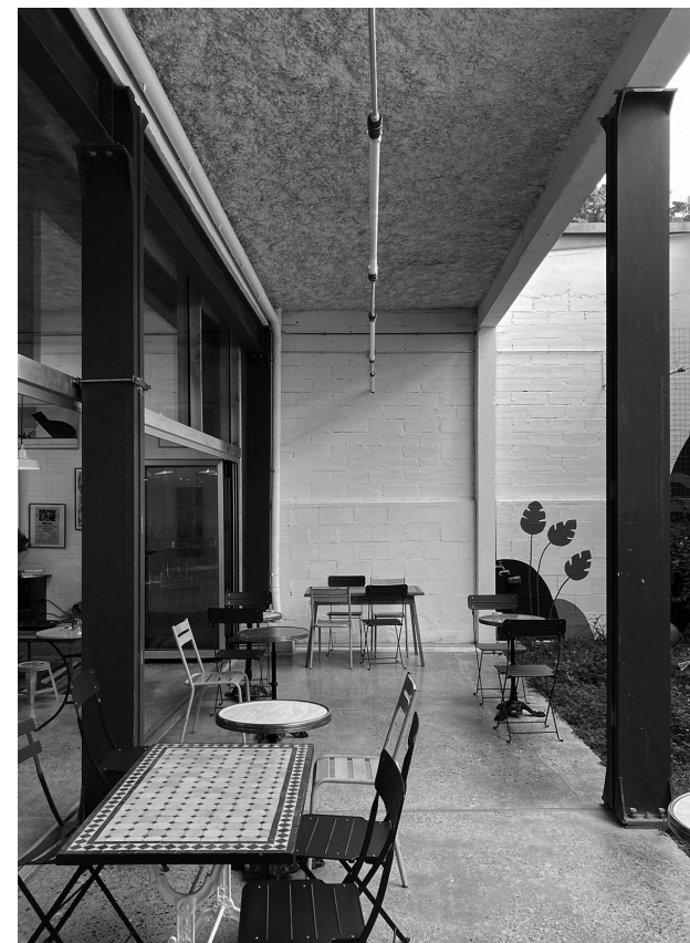
Fig. 4 - The outdoor extension of the dining room of the project T15, with the open patio created by removing part of the roof of the original building (Photo by BAST).

the resources available for the project (BAST, 2025). In its simplicity, this project challenges conventional notions of thermal comfort within contemporary architectural production, or rather, as historian Daniel Barber has theorised, the habit of thinking about a world “After it” (Barber, 2019). However, it is not just a matter of thermal comfort. Here, the broad concept of comfort does not only refer to the physical one, which is linked to an environment’s thermal, hygrometric, and illumination characteristics. It also refers to an immaterial understanding of comfort, primarily the result of cultural constructs and personal habits, each of which can influence how we perceive architectural objects, precluding their reuse and thus preventing the exploitation of their use value (Thompson, 2017). For some, BAST’s unfinished architecture may be disturbing, while for others, it may evoke a fascination for ruin and the permanence of history (Augé, 2004). In the case of the A11 project, some small and old cellars on the ground floor of a closed courtyard