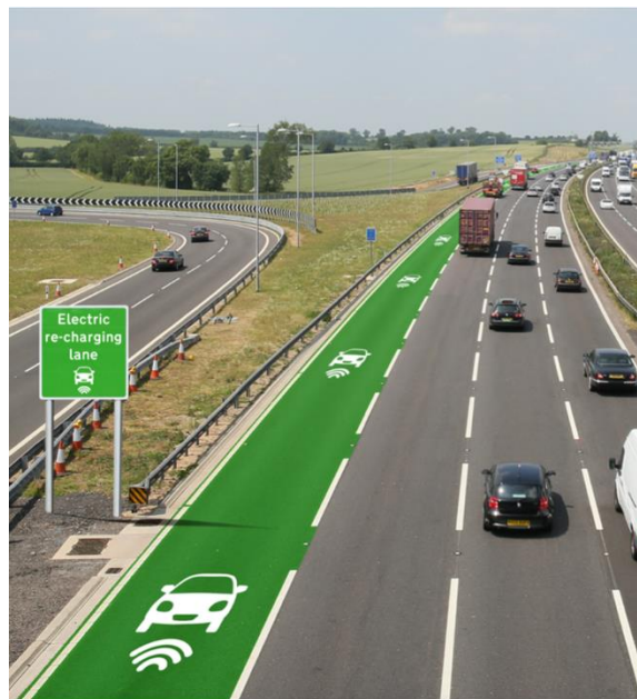
Fig. 3 Possible look of a future charging highway lane.

Clearly, the satisfaction of this balance depends on three factors: the average power absorbed by the vehicles during the journey, the rated power of the charging system, and the arrangement of the road sections equipped with the transmitter section components.