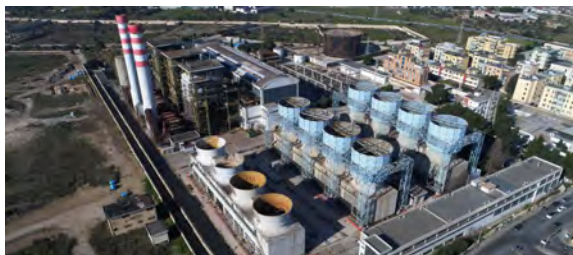
Figure 1 The ex-thermoelectric power plant of Bari (see online version for colours)

The thermoelectric power plant of Bari is characterised by a large size (around 60,000 sqm) and it is in a favourable position in terms of connections and accessibility being placed in an industrial neighbourhood near the city centre and not far from the seaside. Currently, the buildings on the area are in discrete conditions, except for the northern part belonging to the three tanks for fuel oil storage, which shows huge damages related to the fire occurred in 2013 as well as high levels of soil pollution caused by the fuel oils’ spill (Figure 1). Accordingly, the area presents uneven levels of pollution with the consequence that the types of reclamation interventions could be extremely varied.