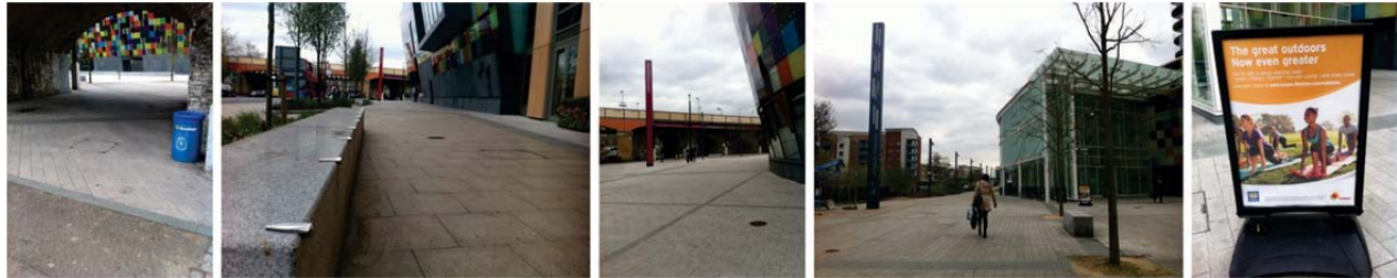
Fig. 6: Renaissance Development.

overdesigned, as if the invisible hand of the architect was being corrupted by the dirty leaved by each footstep. (c) As a jewellery on display, the place seems more an object to be desired from the DLR windows, than a space to be actually consumed.