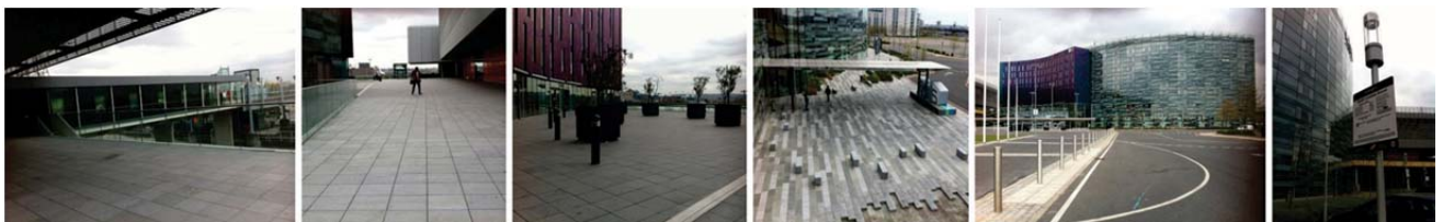
Fig. 5: Aloft Hotel.

Number I New Street Square is utterly privatized. (Concept 'a') Walking down the street, the development is easily perceived. Predominantly grey, the cluster of buildings has gaps in its corners, like spatial fissures that create a passage through the complex. On the other side, in a calmer street, the boundaries snakes the limits of public/private space, and as a lasso accommodate one more bench, in which a working class figure is seated. (Concept 'b') The pavement has straight lines of shade change, like the invisible barriers in the art of Marcius Galan. A small totem with chrome maps, information and a CCTV drawing marks the entrance of the urban fissure. Everybody is wearing suits, some passing by in a hurry. Two figures in black stand in the front of different buildings. As I walk around, I imagine if one of them is watching me, so I take hidden pictures. (Concept 'c') Entering the square, many people are seated in cafes, but only one person is seated on the square benches. In Land Securities website own words, the place is thus outlined: "There has been a real sense of magic around New Street Square since it opened, with the dramatically expanded public realm being used for everything from live sports screenings to local food markets".