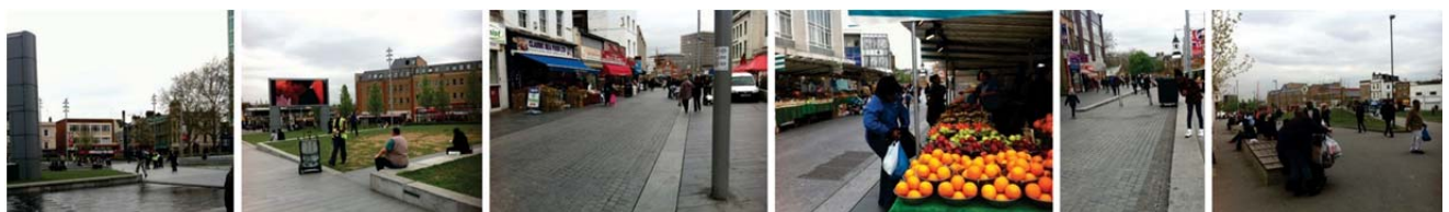
Fig. 7. Woolwich Squares.