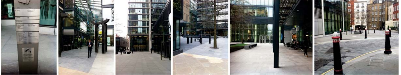
Fig. 4. I New Street Square.

The following lines will delineate these concepts among five of those spaces' experience, representing and describing five "gradations", from the most privatized space to the most public place (N.B.: the concepts do not emerge on the last example).