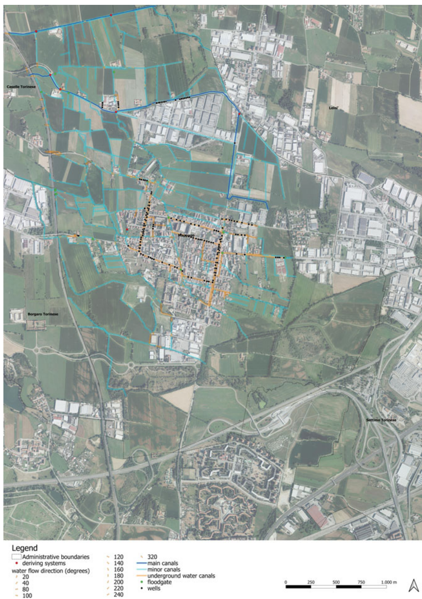
Fig. 3.1 Minor hydrographic system of canals in Mappano area