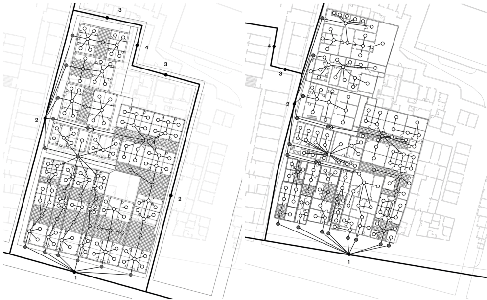
The transition of Topological Networks of Xiaoxihu

Research Group Transitional Morphology Joint Research Unit, FULL - Future Urban Legacy Lab