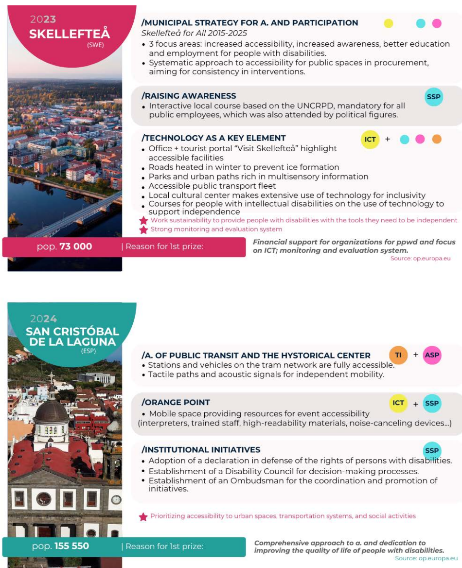
Figure 3. Guidelines design for the PEBA (Architectural Barriers Elimination Plan), Turin Accessibility Lab, 2024, Listing of best practices from winners of the Access City Award.