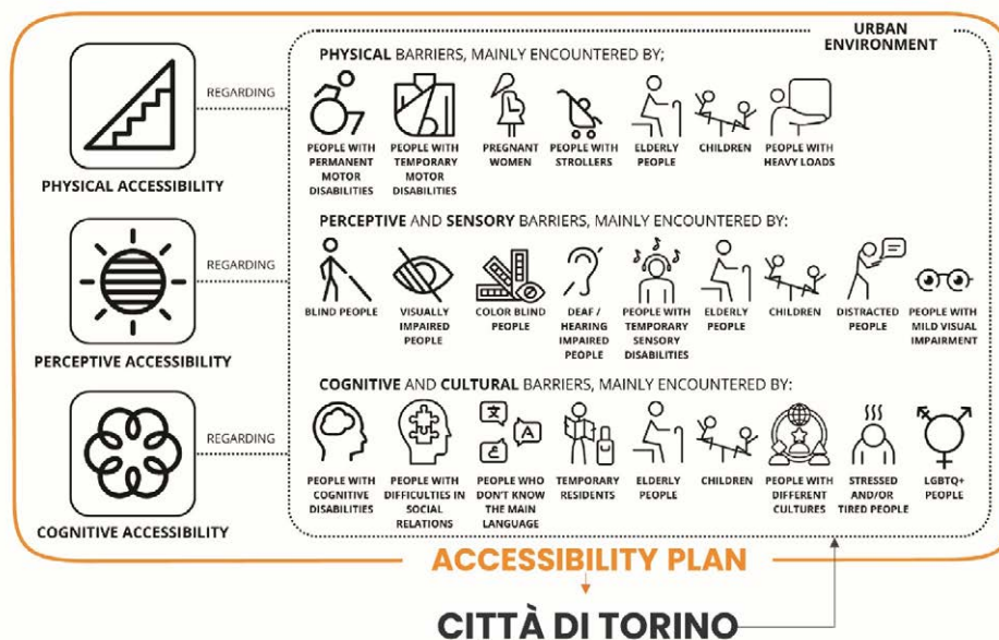
Figure 1. Guidelines design for the PEBA (Architectural Barriers Elimination Plan), Turin Accessibility Lab, 2024, Research context for the Accessibility Plan.

broader and more nuanced understanding of accessibility, incorporating physical, sensory, cognitive, and cultural dimensions, in an effort to encompass as many aspects of urban life as possible to make them more accessible, not only to those with disabilities but to all citizens. The aim was to shift from a PEBA to a wider Accessibility Plan, promoting an approach to urban design that serves the needs of everyone. 3