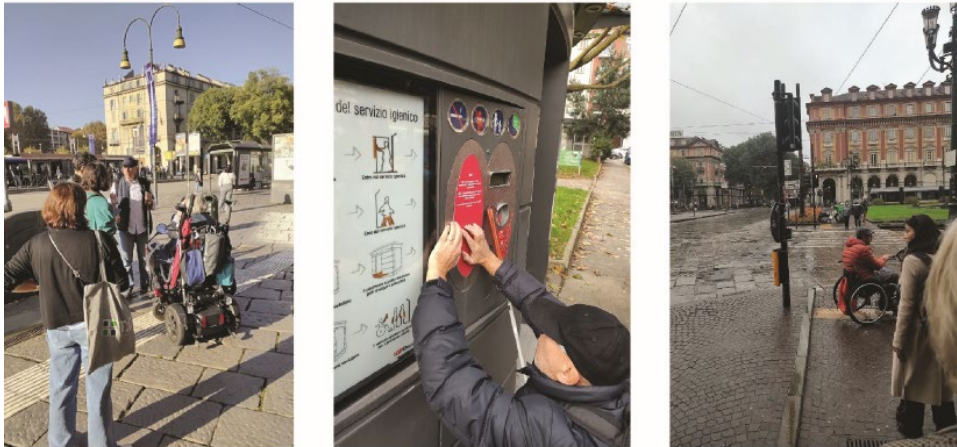
Figure 5. Guidelines design for the PEBA (Architectural Barriers Elimination Plan), Turin Accessibility Lab, 2024, Images from the urban walks.

understanding of their needs. The qualitative insights gathered during these walks through reports from both the researching team and the participants were subsequently integrated into the evaluation criteria for public space and building accessibility.