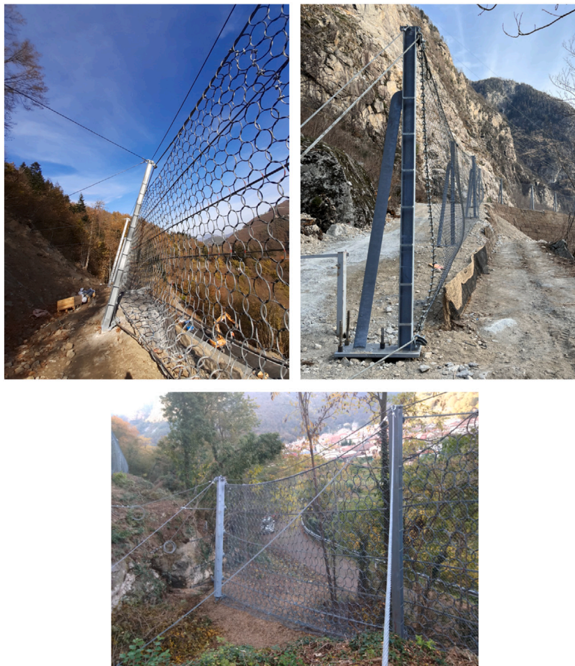
Fig. 2. Rockfall net fences construction sites.