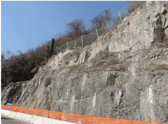
Fig. 1. Net fence and drapery mesh construction sites (Lago Maggiore, Italy).