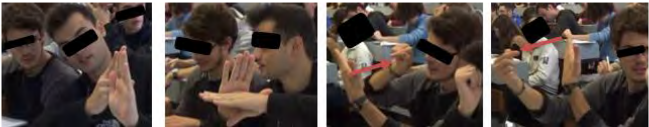
Figure 2 (a,b,c,d): key gestures performed by the students while solving the task

At the beginning, they start drawing the transformation on their notebooks. They reason a bit on the drawing but struggle to visualize the three-dimensional transformation and thus which are the vectors that keep the same direction when transformed. Then, they start representing the situation with their hands, gesturing in the air (Fig. 2a). Doing so, they immediately realize that all the vectors staying on the student on the right's hand (representing the plane of reflection), remain fixed by the transformation, that is they stay on the same direction and keep the same magnitude, meaning that they are all eigenvectors related to the eigenvalue 1. They easily visualize that this property is shared by all the vectors staying on the plane. Later they start looking for other different eigenvectors. They state that all the vectors lying in the plane perpendicular to the reflection plane (represented in Fig. 2b by the student's left hand) are eigenvectors related to -1. They do not seem very sure about it, and explore various similar configurations by moving their hands. At one point, one of the students (Fig. 2 c and d) begins representing the vectors with his right index finger and, by moving it in different directions, realizes that all and only the vectors lying on the line passing through the origin and perpendicular to the reflection plane (represented by his left hand) are eigenvectors related to -1.