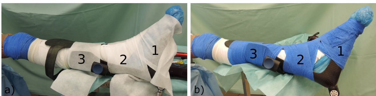
Fig. 1 Configuration of the bandage system on the lower extremity using a single layer of iFIX fleece (a) and a double layer of CO (blue) (b) in three zones: (1) foot, (2) proximity of the ankle (3) shank

Mean, median, range, and standard deviation were calculated for the different measurement parameters. For the analysis, GraphPad ® Prism (Version 10.2.3, GraphPad Software, Inc., La Jolla, US-CA) was used.