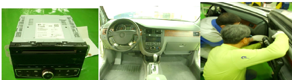
Figure 2. Radio asm-am/fm stereo & audio disc player 92199291 is replaced radio with p/no. 42356100 module.

To simplify the execution of complete compliance tests, the R&S ® CMW run sequencer software tool is added . This R&S ® CMW-KT110 option provides ready-to-use test sequences to perform end-to-end modem compliance testing and within the e Call and ERA-GLONASS band in line with applicable standards. The available packages verify the conformity of the modems within the voice band, according to the specifications CENEN16454, ETSITS103412 and GOSTR55530 (GOST33467). We can conveniently select and combine the required test sequences on the simple user interface. The R&S ® software CMW run automatically configures the test tools, the PSAP and, if supported, the IVS under test via remote control. Runs the selected tests and generates a complete test report indicating success / failure for each test case.