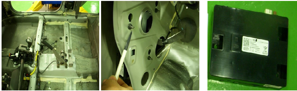
Figure 3. Asm-comn interface and nut communication interface is new added era-module with p/no. 94537 module.

Figures 1 and 2 show that when the ability to verify compliance with standards from the first stage of a project allows you to promptly adopt corrective measures and optimize an IVS module. Generates GPS, GLONASS, Galileo, BEIDOU, QZSS and SBAS signals on up to 24 channels. The versatile and flexible configuration options allow you to create even complex GNSS scenarios. Fixed and mobile receivers can both be simulated easily, as well as ionospheric and tropospheric influences and complex disturbances that may be present in the receiver environment, for example multicam propagation, darkening and particular characteristics of the antenna.