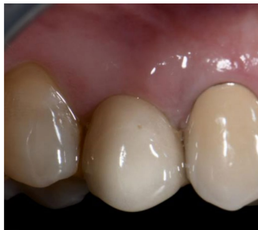
FIGURE 3 | Clinical appearance of test implant in regio 1.5 at T3.