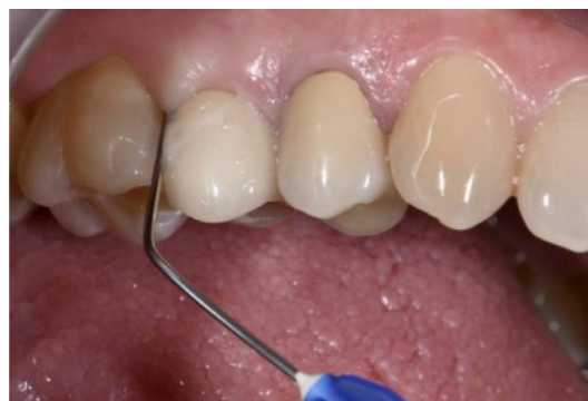
FIGURE 2 | Clinical application of Xanthan and Chlorhexidine gel following PMPR.

Clinical parameters were assessed at baseline (T0), at 30 (T1), 90 (T2), and 180 (T3) days. One experienced and calibrated examiner (J.L.) (Kappa score 0.907; 95% confidence interval [CI] 0.894 to 0.999; p < 0.01 ) performed all measurements and recorded