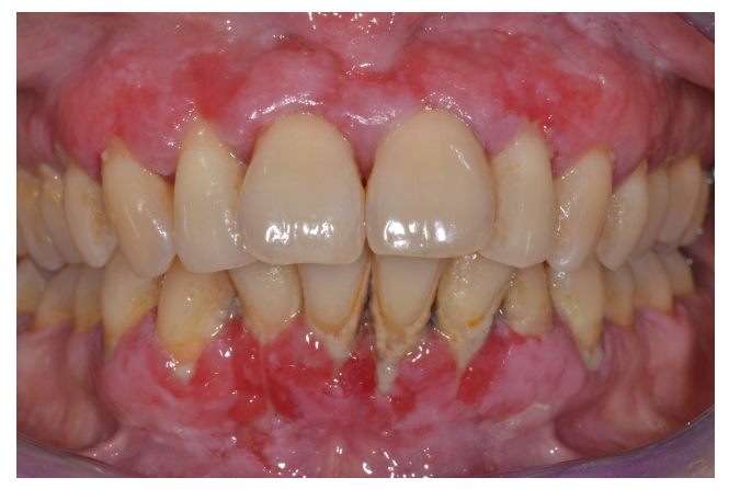
FIGURE 3 Case of a patient not regularly attendant a dental office.

independently of the treatment given. Gingival OLP lesions share similarities with oral OLP lesions, but exclusive gingival lesions are however rare and unlikely to undergo a malignant transformation. Possibly, the gingiva lesions anticipate other oral involvement, and this must be valued by general dentists and periodontologists. As already reported, maintaining a good degree of oral hygiene, and being regularly checked may contribute to a reduction in reported symptoms and therefore to less possibility of immunosuppressive treatments. As most of the patients have a chronic disease, they need to be reviewed for many years by proper trained oral clinicians, and primary dental healthcare employees.