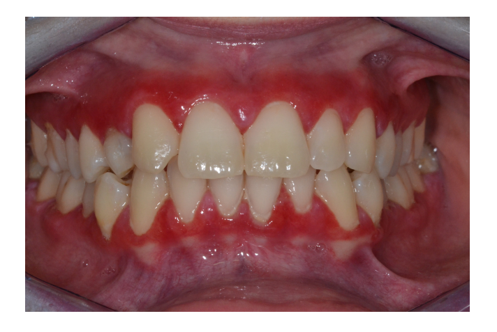
FIGURE 2 Case of diffuse red gingival lichen planus (typical case of desquamative gingivitis).

the unique site in 103 cases. Considering the total sample size of 3173, 41.6% manifested gingival and oral lesions and 3.2% exclusive gingival lesions. The demographic and clinical features of total subjects are detailed in Table 1. Comparing subjects with only gum involvement with those with other oral manifestations, the former was younger and less often smokers (p = 0.0008 and p = 0.015, respectively).