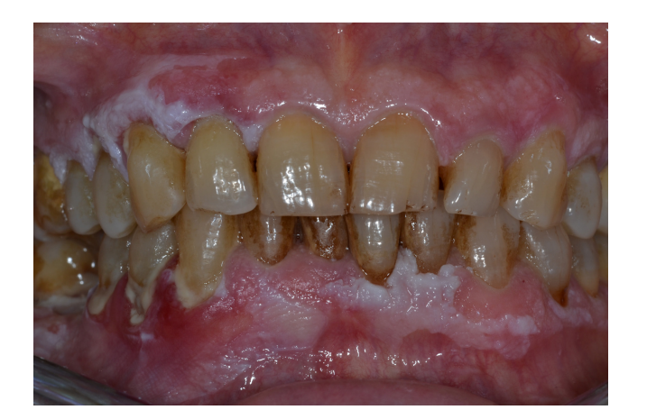
FIGURE 1 Case of diffuse white gingival lichen planus.

As previously detailed (Camacho-Alfonso et al., 2007), white forms were the most recurrently reported in pure gingival lesion, and the most common gingival location was the concurrent involvement of the attached and marginal gingiva.