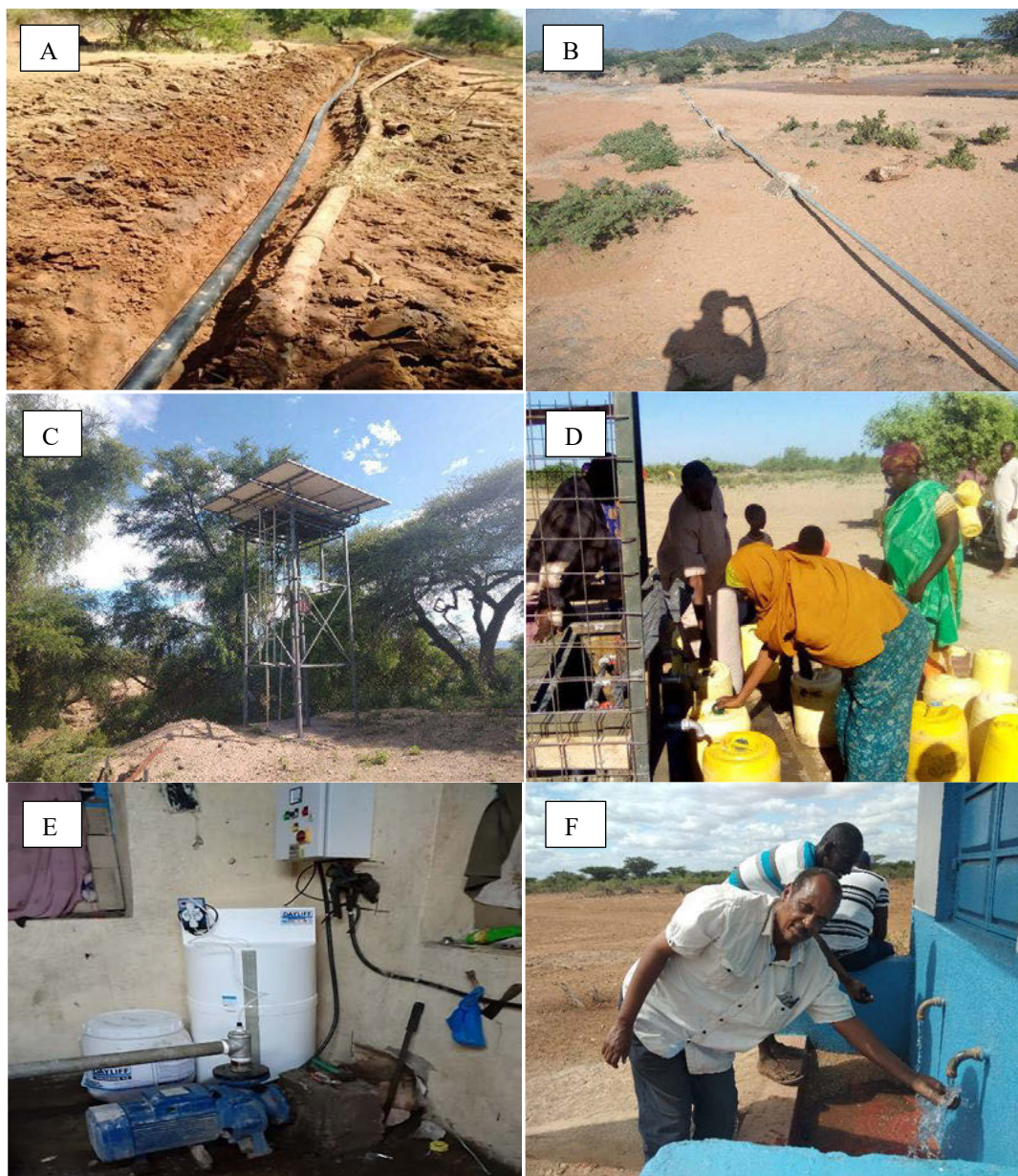
Figure 2. A) New installed HDPE pipes in the Bulesa village B) New pipeline in the Kipsing village. C) Borehole in the Kipsing Village with added solar panels for the new pumping system. D) Women fetching water at a community water point in Sericho village. E) In-line chlorine dosing equipment installed for Kinna village water supply system. F) The director of the water service during the launch of the new water kiosk in the Gafarsa village

the aqueduct pipeline were damaged, disrupting safe water access to people. Water pumping equipments for Oldonyiro and Kipsing villages were also damaged. In total the flood affected a population of about 24,000 people in the study area [9]. The emergency project was aimed to repair and desilt the intakes of boreholes, replace the damaged pipelines and pumping systems, and install other ancillary structures to ensure access to safe water for the affected population. In addition, it was proposed to install inline chlorine dosers for Kipsing, Oldonyiro and Kinna villages which rely on surface water abstraction from sand dams and natural springs (Figure 2).