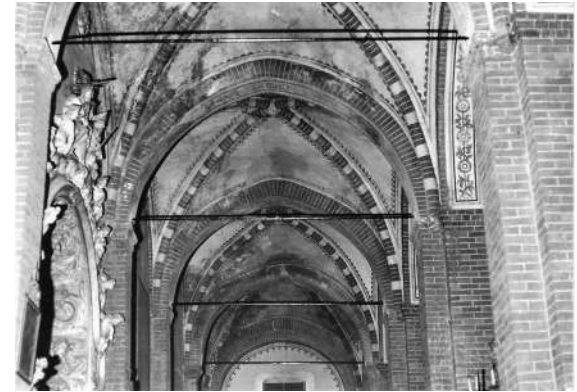
Fig. 2 The chains in the left nave during the restoration yard of 1974-1977.

Endoscopic inspections were performed inside the disconnections in the cement tiles floor