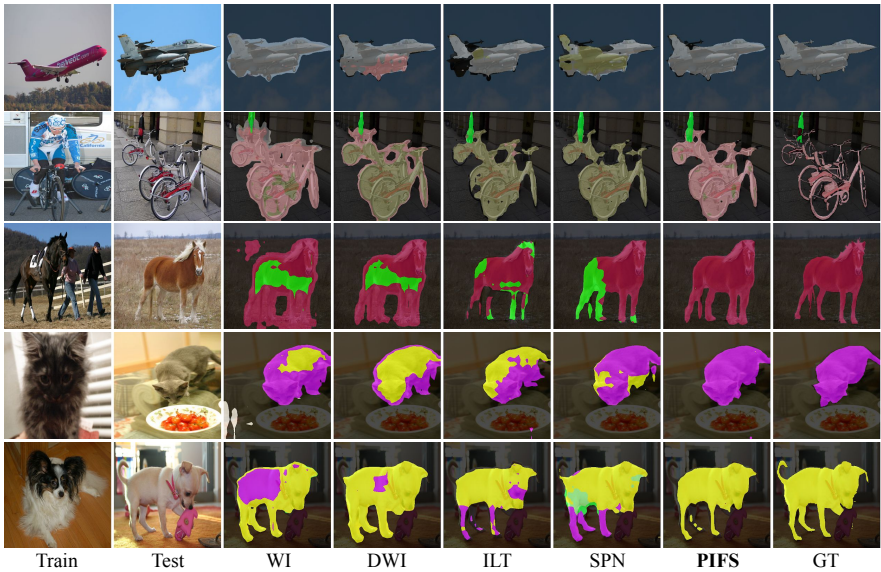
Figure 3: Qualitative results on the VOC-SS 1-shot setting.