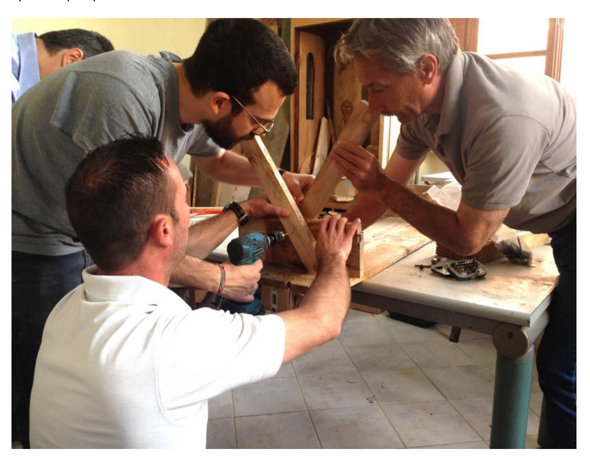
Figure 3. Designing together in the carpentry lab of Costruire Bellezza.

The next challenge in 'Costruire Bellezza' is to sustain design practices that promote learning, experimentation, connection with external realities, toward a continuous regeneration of the project itself. This goal can be achieved only by working on the values shared among the actors. These values can be generated and enhanced throughout design activities that are able to bring together innovation, personal creativity, sharing, flourishing, personal development and optimism, in a systemic perspective.