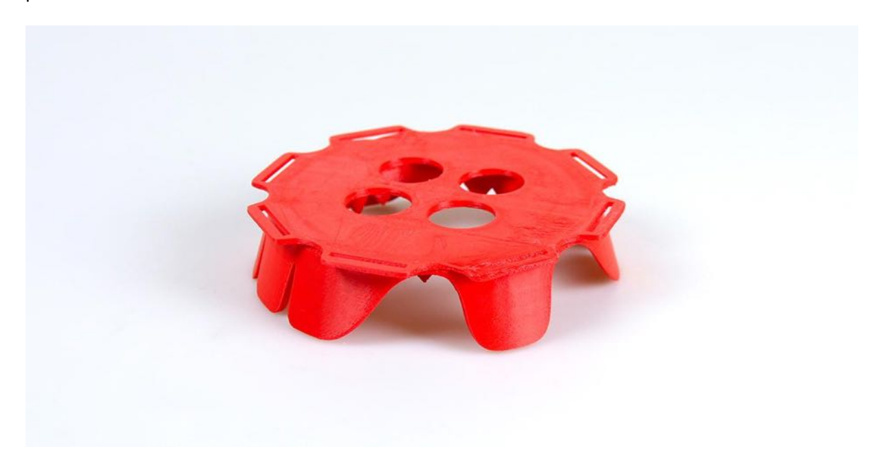
Figure 1. Antonino: a co-designed tool to open thickened water packaging can.

The next challenge is to monitor how the aids could impact also on the care networks that rotates around the individuals (families, organizations). Whereas, on a wider perspective, the challenge is to understand how many sufferers could benefit from a customized production of the aids and how to reach them. So a scaling process of the project can be discussed in terms of transferability of the products to other AISM beneficiaries.