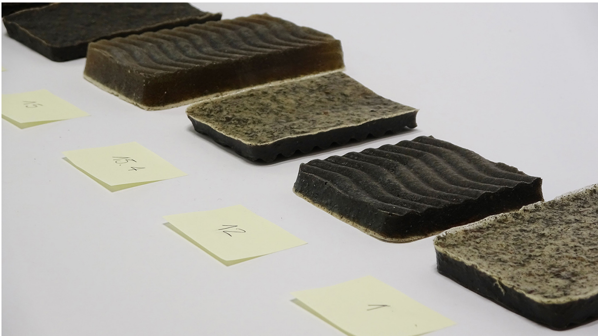
Figure 2. Samples of dried materials with different surface finishes.

Moreover, it is possible to obtain a spongy appearance in samples thanks to the reaction between an acid and a base. If the reaction takes place with the fire off, we obtain very light samples, however, if the reaction takes place with the heat on, we obtain a spongy material but heavier than the first. In this case, during the drying phase, this kind of samples reduce a lot in volume and harden more and more until a material similar to a resin, with a regular, homogenous surface and a waterproof surface finish. The introduction of a surfactant, on the other hand, makes it possible to obtain samples with very elastic behaviour. In the drying phase samples use to shrink a lot, losing 15% to 60% of their initial volume. Generally, these samples present a better and smoother surface finishing.