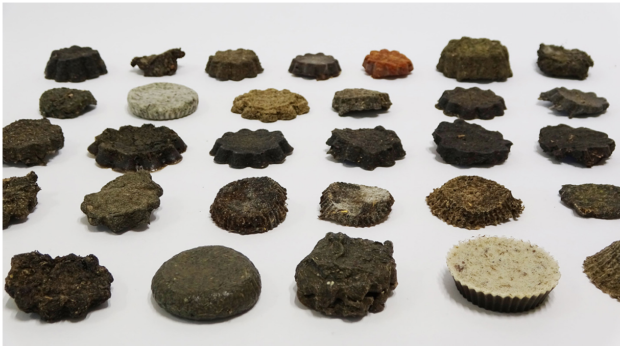
Figure 1. Samples of materials obtained by experimenting with different recipes and further variations.

The first step consists of the collection and subsequent dehydration of the aquatic vegetable fronds. Once the vegetation was collected from the Po River, fronds were left to dry at room temperature (17-19°C) for a week. Once fronds were dried, they were grinded using a laboratory blender until obtaining a powder-like material, consisting of fragments ranging from 0.01 cm to 0.3 cm. Thus, six basic experimental protocols were firstly designed and then 31 variants of these protocols were then experimented, changing doses of components to obtain varied final characteristics and properties (Figure 1).