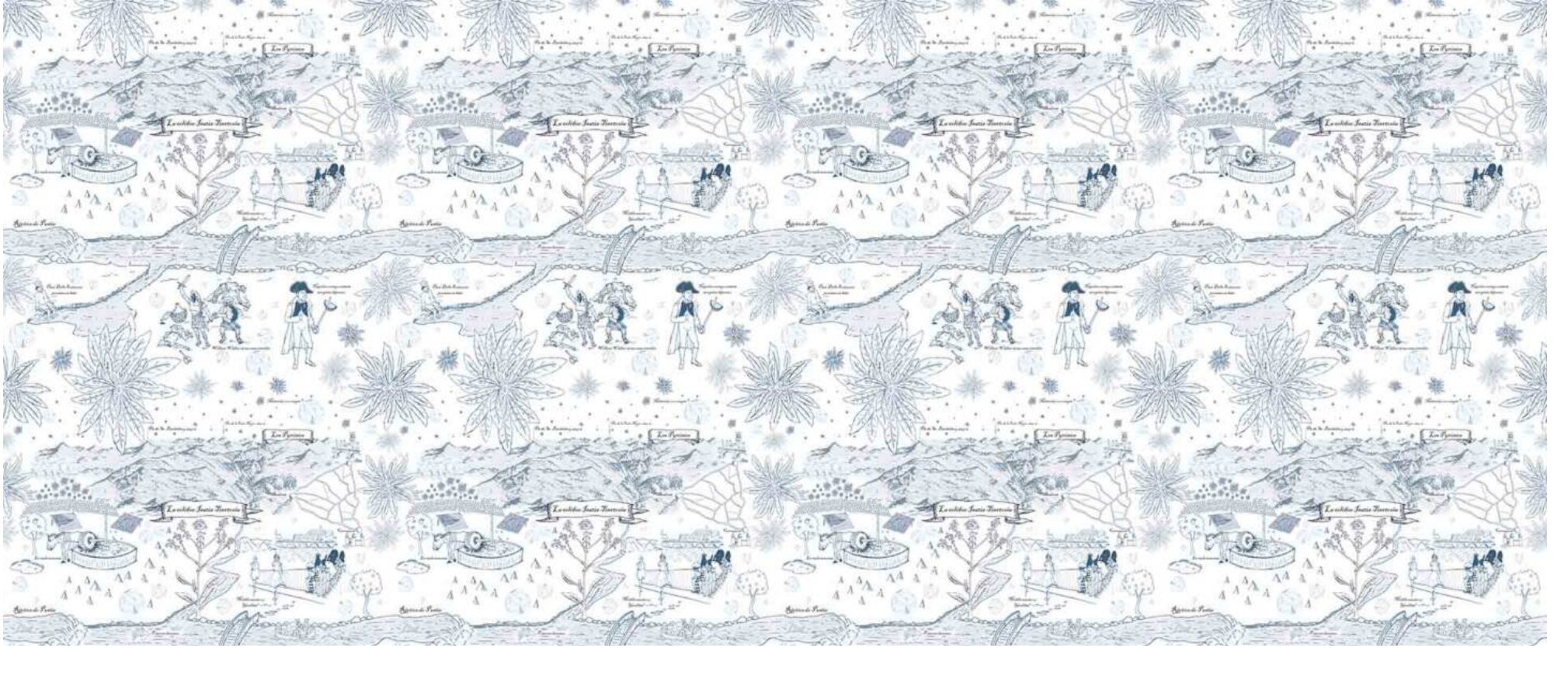
Blue World x16