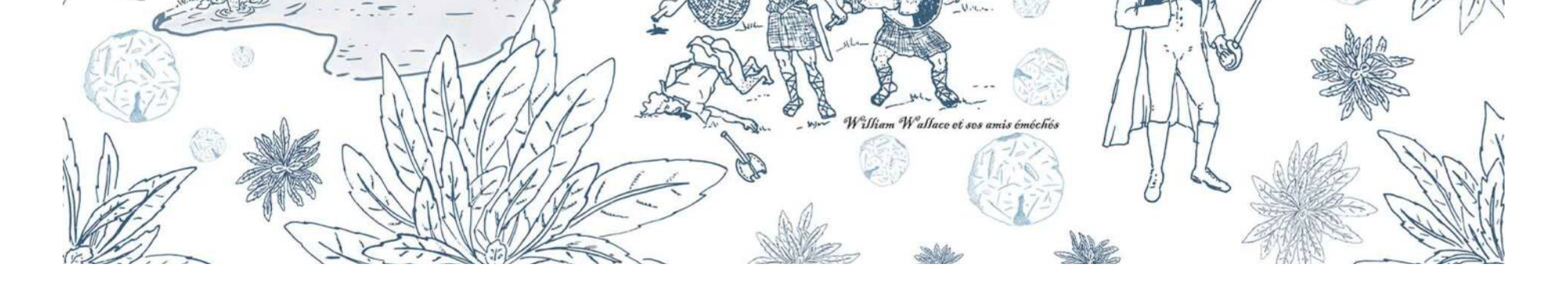
Blue World. Drawing of Remondinian inspiration representing the Blue World of Isatis Tinctoria. Cocagnes rains from the sky while inhabitants enjoy their pastis and melon.