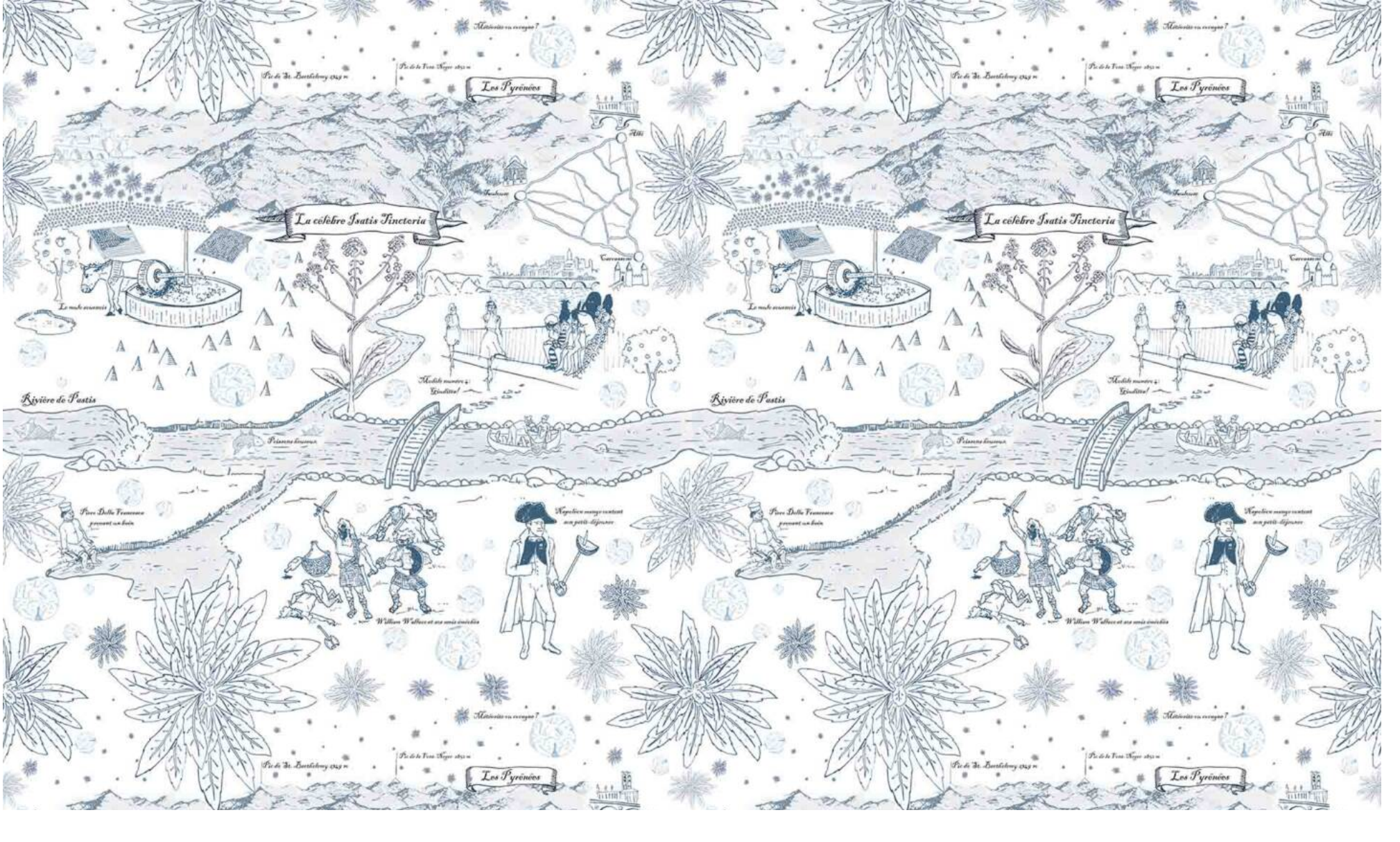
We use cookies to ensure that we give you the best experience on our website. If you continue, we'll assume that you are happy to receive all the cookies on the Quinta Colonna website. Read about how we use cookies and how you can control them by clicking "Privacy Preferences".