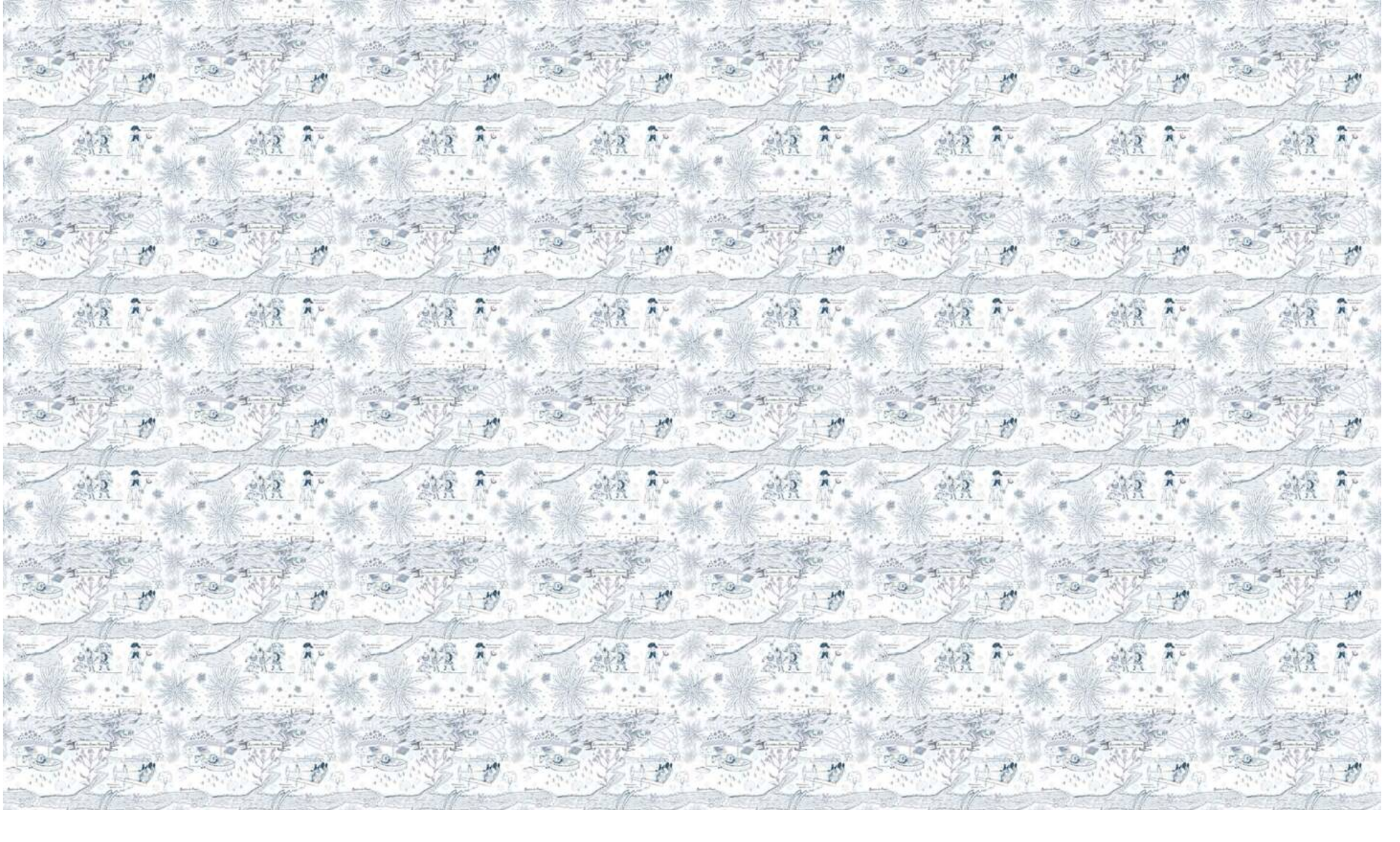
We use cookies to ensure that we give you the best experience on our website. If you continue, we'll assume that you are happy to receive all the cookies on the Quinta Colonna website. Read about how we use cookies and how you can control them by clicking "Privacy Preferences".