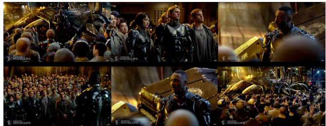
Figure 10. Segment from Pacific Rim. For a better visualization https://www.youtube.com/watch?v=-7Sow81yi24 , from 1:30 to 2:00

humans, usually representing dialogues. In this scene, we have a much slower pace with respect to segment 1 and the focus is more on the characters rather than the global context. If we take two segments from different classes that come from the same basic editing pattern cluster we notice fewer differences. The segments shown in 1 are extracted from class 43, which is entirely created from basic editing set 8. The complete segments are reported in Figure 8 and in Figure 9. The scene segment represented in both cases contains mainly medium shots of people interacting with objects. The fact that the two segments end in the same way is partly coincidental. By this, we mean the segments represented by a class can have varying structures as long as they stay within the limits indirectly defined by the editing pace and trend labels.