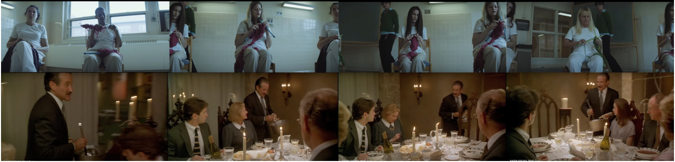
Figure 1. Camera movement showing people interacting with objects from "Thoroughbreds" (top), and "The Birdcage"(bottom).