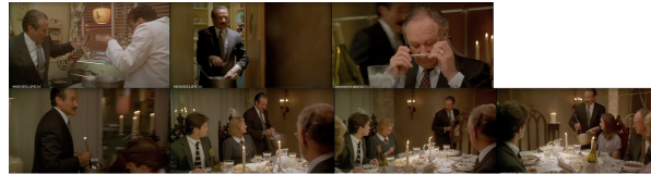
Figure 9. Segment from the birdcage. For a better visualization https://www.youtube.com/watch?v=1pJyWLQLzCA , from 1:00 to 1:30