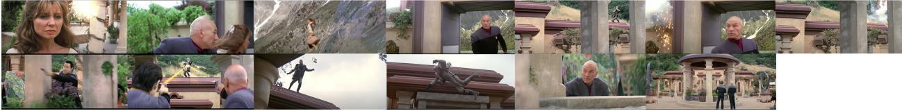
Figure 6. Segment from StarTrek. For a better visualization https://www.youtube.com/watch?v=-1gCG8m1SHU , from the 0:30 to 1:00