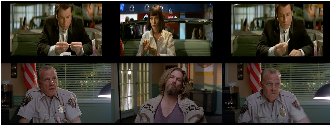
Figure 2. Shot reverse shot extracted from "Pulp Fiction"(top) and "The Big Lebowski"(bottom).