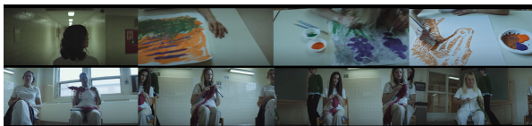
Figure 8. Segment from Thoroughbreds https://www.youtube.com/watch?v=1bBOUr7rAHw , from the 0:30 to 1:00