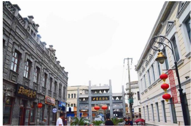
Figure 1. Well-renovated and upgraded area in Daowai district after the first phase of the renovation project.

people were forced to relocate from their live-since-born houses, which caused tension and widespread discontent (Zhang, 2021). In particular, hard-to-access residents, as minority groups, due to the highlighted ethnicity, religion, disabled issues, etc., were largely ignored in the heritage management process. Decision-making processes related to heritage management should be inclusive and involve the participation of broader communities. Research on revealing people's stories and preferences concerning the Chinese historic urban landscape in their visiting and living experience is needed to address this concern directly.