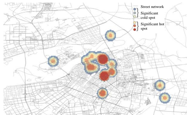
Figure 5. Spatial Patterns of User Preference for Heritage Values.

Figure 5 and Figure 6 depict the spatial distribution of users' preferences for heritage following the application of geographic information visualization and analysis. The results of the study revealed a correlation between cultural and natural attributes within the city, as well as tangible and intangible attributes. Users located in the central historic district demonstrated a pronounced interest in the complex social values attached to heritage (see Figure 5), while those focused on the tangible heritage aspect tended to come from the urban periphery (see Figure 6). The findings further suggest that static spaces and dynamic cultural and spiritual needs, as well as urban ecology, remain relatively disparate. This may be attributed to the fact that urban heritage regeneration policies, such as the Chinese Baroque regeneration project and related regulations, are often treated in isolation from other aspects of the city and do not account for the urban environment. The complex relationship between semantics, space and the urban environment needs to be explored comprehensively in subsequent studies.