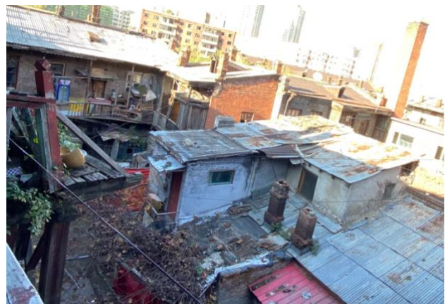
Figure 2. Fading and decaying historic area in Daowai district caused by uncontrolled urbanisation.

The Chinese Baroque district in Harbin represents an important chapter in China's history, reflecting the cultural exchange between China and the West during the early 20th century. The district is a unique blend of Chinese and Western architectural styles, showcasing the creativity and ingenuity of the architects and builders of the time. The district is not only a testament to the rich cultural heritage of Harbin but also a symbol of China's progress and development over the past century. However, despite its significance, the Chinese Baroque district in Harbin is facing numerous challenges in terms of heritage conservation. One of the major challenges is the rapid pace of urban development, which has resulted in the destruction of many heritage buildings. Additionally, the district has suffered from neglect and a lack of investment in conservation efforts, which has led to the deterioration of many buildings.