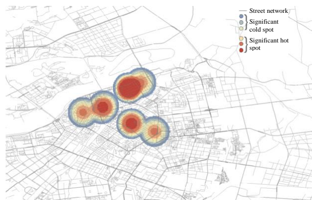
Figure 3. Spatial Distribution of Users' Positive Sentiment towards Chinese Baroque Urban Heritage Conservation Projects.

Figure 3 illustrates that the users expressing positive emotions are concentrated in three specific areas: the historical district of Daowai (Chinese Baroque), the Heilongjiang Provincial Museum (the default positioning in Harbin), and the historical landscape of Central Street (a famous tourist attraction). The Chinese Baroque area exhibits the highest concentration of positive sentiment, with approximately 60 items of data, followed by the Heilongjiang Provincial Museum with around 40 items, Central Street with only a dozen items. In the interim, a significant proportion of users provided unequivocally positive feedback regarding the three aforementioned areas. However, unfavorable comments predominated in the remaining peripheral areas. Users from outside Harbin's central historic district and even from suburban counties seem to have a rather critical attitude towards urban heritage conservation (see Figure 4).