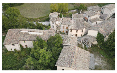
Fig. 4. Drone photography of Gabbiano and its landscape

Gabbiano is a small and rural settlement in the hamlet of Pieve Torina (Macerata district). Standing over a hill, the village is composed of eight buildings (with different private properties) and one church on a principal sinuous path axis (Fig. 4).