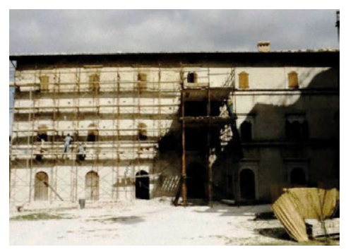
Fig. 3. Photography from 1988 testifying the presence of plaster on the Shrine façades

One of the main topics is the potential reintroduction of the plaster on the natural stone façade of Palazzo delle Guaite. Historic research, historical pictures (Fig. 3), and an accurate survey of the masonry stone suggest that the exterior aspect of that building was historically characterized by the presence of plaster. The reintroduction of plaster, in addition to FRCM (Fabric Reinforced Cementitious Matrix), would nowadays be a proper method to increase the mechanical resistance of the masonry and, concurrently, restore the historical appearance of the building.