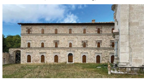
Fig.1. View of "Palazzo delle Guaite"

Besides the central plan church, characterized by square honed stones (ashlar masonry), the complex consists of four main buildings: Palazzo delle Guaite (Guardhouse) (Fig. 1), Casa dei Pellegrini (Pilgrims' house), Casa dell'Armata (Army house) and Fontanile (Fountain building).