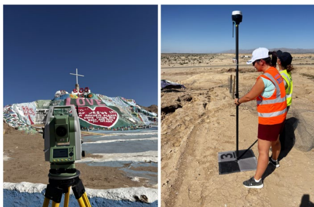
Figure 2. Topographic and GNSS survey.

Survey details are described within the survey report (McAvoy et al., 2024) and here summarized. The survey campaign has been carried out on October 25 th , 2023. The entire area has been documented integrating traditional and experimental Geomatics techniques. Employing a DJI Mavic 3 Pro, a multi-scale Uncrewed Aerial Vehicle (UAV) survey has been performed, acquiring both nadir and oblique images to collect data regarding the entire site and the surrounding area. Terrestrial photogrammetry has been employed to document the indoor environment of the "Hogan" (a Navajo name for certain adobe structures), the northern nook, where the slope had collapsed, and all the trucks, tractors, and cars placed in the Salvation Mountain area. Also, both a TLS and a MMS approach has been adopted to acquire data concerning the overall complex, including the indoor part of the Museum. A total of 47 static scans have been acquired using a Leica RTC360 system, and as regards the MMS survey, 3 scans of 15 minutes each have been performed employing a Stonex 120 GO platform. A topographic and a GNSS survey have been performed for the metric control and georeferencing of the final 3D point clouds (Figure 2).