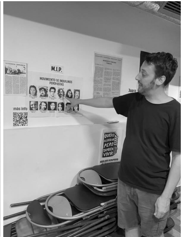
Figures 2 & 3

Figure 2 (left): Communication of Movimiento de Inquilino Peronista at the wall of IA space.