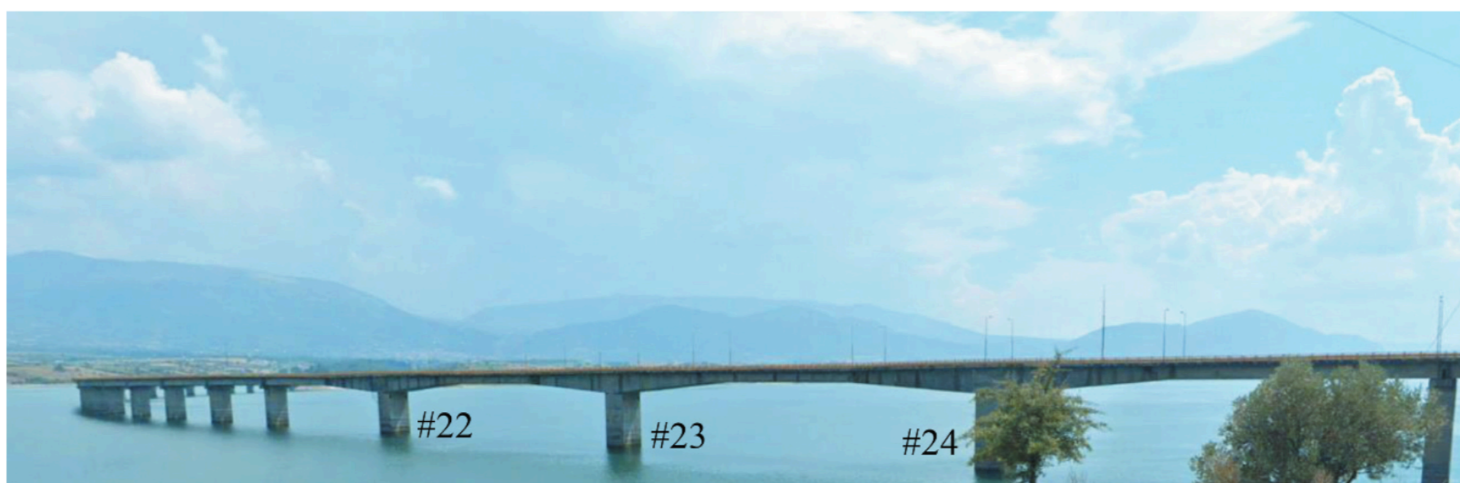
Figure 1. The Polyfytos bridge and the three piers under evaluation.

Typically, extensive material sampling, destructive testing, and vibration/loading assessments are utilized to evaluate material conditions. However, due to concerns about critical points on the deck's capacity, the owners did not authorize these methods (Markogiannaki et al. 2022). Furthermore, because of the bridge's importance in the bustling national road network (part of the E65 Central Greece Highway), conducting tests that could disrupt traffic necessitates considerable challenges.