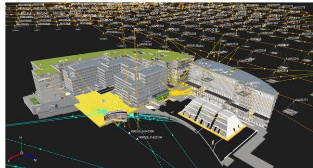
Figure 2. BIM model, UAV images and GNSS track, scan data referenced to TPS observations (yellow vectors), GNSS observations (light blue vectors).

A focus of this paper is to refer and explain the utilisation of imagery-derived results within geodetic workflows, and that this processing is combined and taking advantage of the other sensor data available. To make imagery effective with all standard survey geodetic applications, Infinity takes the approach of bringing the image pose position acquired with the UAV GNSS sensor directly to the project coordinate system. The fact that the image poses are already projected in the coordinate reference of the project data removes the uncertainty of projection distortion of the image pose position. When importing UAV data using the WGS84 position, the user is already able to view the location of images with respect to all project data including total station, RTK GNSS data and even more practical for construction, to view the flights along with the BIM model (Figure 2). One important advantage to this is knowing before processing the images, the data is meeting the task objectives, minimizing possible processing problems.