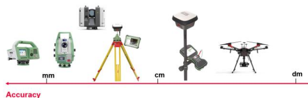
Figure 1. Each device can reach a different accuracy level.

All the mentioned devices complement each other towards the project's objectives, having different purposes and working accuracy ranges, as shown in Figure 1.