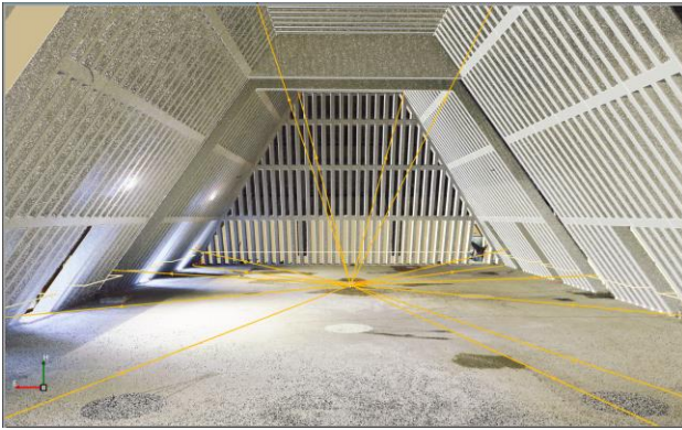
Figure 3. BIM model and scan data referenced to TPS observations (yellow vectors), resected from GNSS control points.