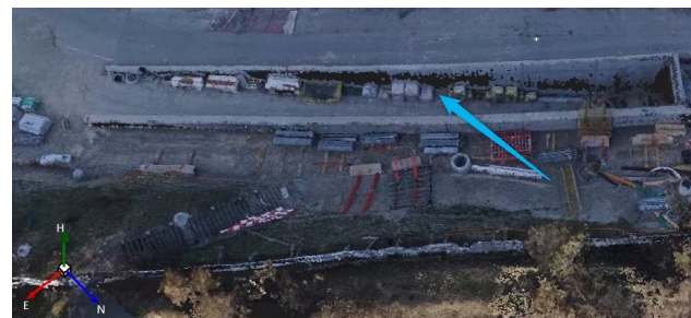
Figure 7. Example of missing data in a narrow driveway due to obstructions.

Overall, a high completeness reconstruction level is reached. Some areas, though, show that there is still room for improvement (Figure 7). For such cases, a terrestrial imaging tool such as the Leica GS18 I GNSS RTK rover could contribute to the construction site monitoring, being able to acquire GNSS RTK points and images at the same time, adding details in areas obstructed from a bird's eye view.