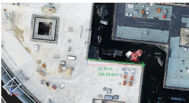
Figure 5. Zoom on generated orthophoto. Distance can be easily computed defining start and end points.

Image orientation (including camera self-calibration) is computed in Infinity, based on Structure from Motion techniques integrated with bundle block adjustment, to derive DPC, DSM, Orthophotos, and to compute volume variation by differencing DSM. Measurements on such generated objects can be easily carried out in the set reference frame, such as measuring distances on the Orthophotos as shown in Figure 5.