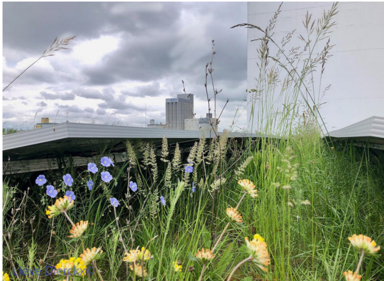
Figure 1: Roof of the shopping centre Stücki, Basel, Switzerland. Plant species rich extensive green roof with photovoltaic installation.

When designing a biodiverse extensive green roof (with and without photovoltaics), it is important to consider that substrate heterogeneity and structural richness are essential. Extensive and professional maintenance and the use of local plants adapted to the extreme roof conditions are vital to establish a dynamic self-sustaining vegetation while at the same time making full use of regenerative energy production. Therefore, we recommend promoting heterogeneous extensive green roofs as a diverse habitat for flora and fauna.