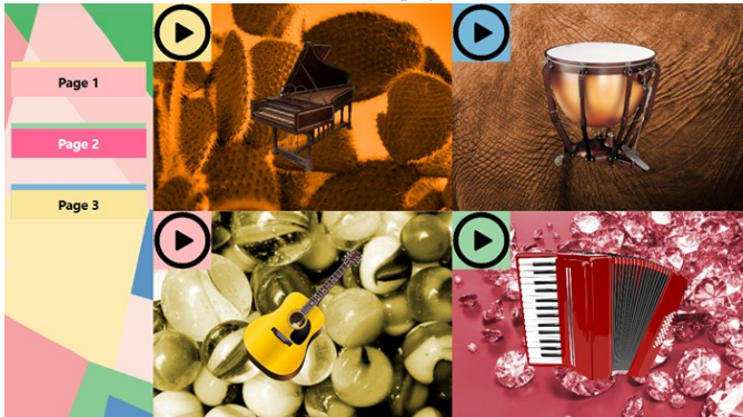
(b) Second page