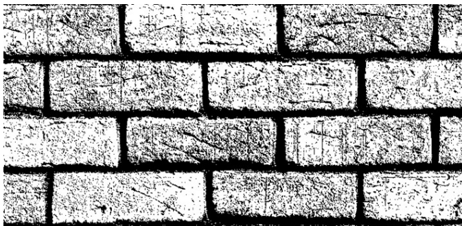
Fig. 2: Black and white image rendering for haptic texture design

by category is reported in Table I. For the sake of limiting the time required for the completion of the questionnaire, a reduced version was also produced, containing a subset of 6 questions obtained by random choice among two predefined splits of the initial set. Students were offered the reduced version of the questionnaire, whereas staff members answered to the full version. On average, around 30 sets of answers per instrument were collected. A summarized version of the results is reported in Table II, where for each instrument and category we listed, in descending order, the two/three most selected attributes. The complete set of associations of attributes to the different instruments and categories is shown in Figure 1. The above-reported results were then used for the selection and adjustment of the various images to display on the interface prototype. The final selection of attributes was performed as follows: