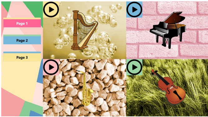
(a) First page