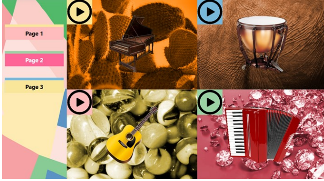
(b) Second page