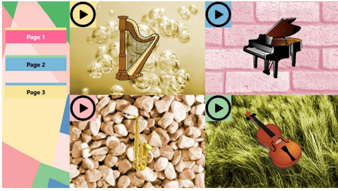
(a) First page