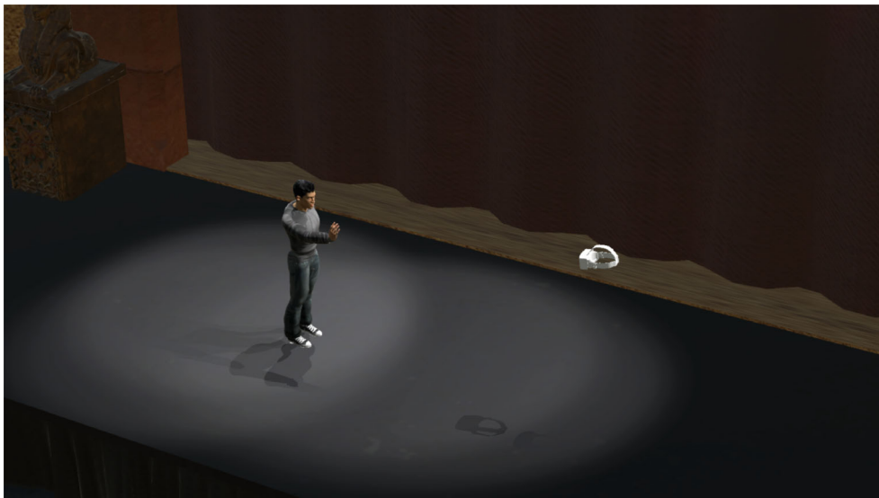
FIGURE 2 Area of the stage scenario in which the participant (represented by the white HMD) can move around to spectate the avatar during the acting.

suitable for this kind of investigation. Therefore, it was necessary to create an ad-hoc set of questions aimed to measure relevant aspects, such as the comfort with the representation, expressiveness, realism, naturalness, likelihood, pleasantness, emotional conveyance, and overall preference. This process was repeated for the six emotions. In order to limit the possible ambiguity of questions related to comfort and pleasantness when applied to negative emotions (i.e., disgust, anger, and sadness), the participants were told to approach the scenes with a neutral and detached point of view with respect to the emotion expressed. Finally, the participants were asked to provide comments in the form of open feedback. The full questionnaire is available for download 8 .