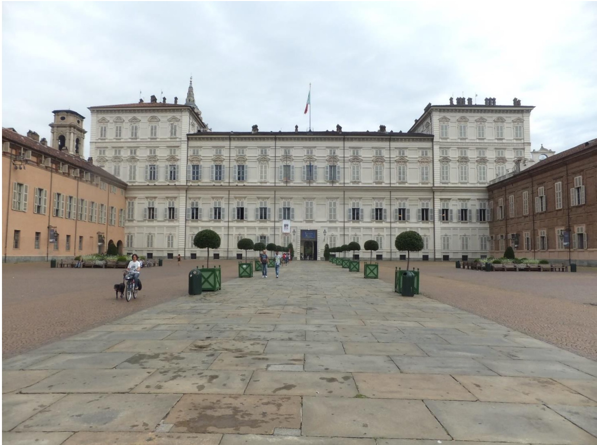
Photo 1) Turin, Royal Museums, Royal Palace (Ascanio Vitozzi 1584, Maurizio Valperga, 1643, Carlo Morello, 1658), the main façade (Creative Commons 2.0, 2015) 22

A strategic element of this system was – and still is, having been incorporated in the layout of the expanding city – the system of avenues connecting the walled city and the residences in the countryside. The city built in a grid pattern becomes a radial centre from which connecting avenues, usually lined with elms, branch off, leading to Mirafiori, the Queen's Villa, Regio Parco, Valentino, i.e., the structures closest to the city, and to Venaria Reale, Stupinigi (11 km, from 1753), Rivoli (13 km, from 1713). The last complex – according to Benevolo – was one of the largest projects on a territorial scale realised in Baroque Europe: the axis, consisting of a 13 km long tree-lined avenue, continues for a further 6 km in the same direction, and connects the east façade of the Rivoli Castle with the Royal Church of Superga, 19 km away as the crow flies, the antipole of the system conceived by Filippo Juvarra in 1715.