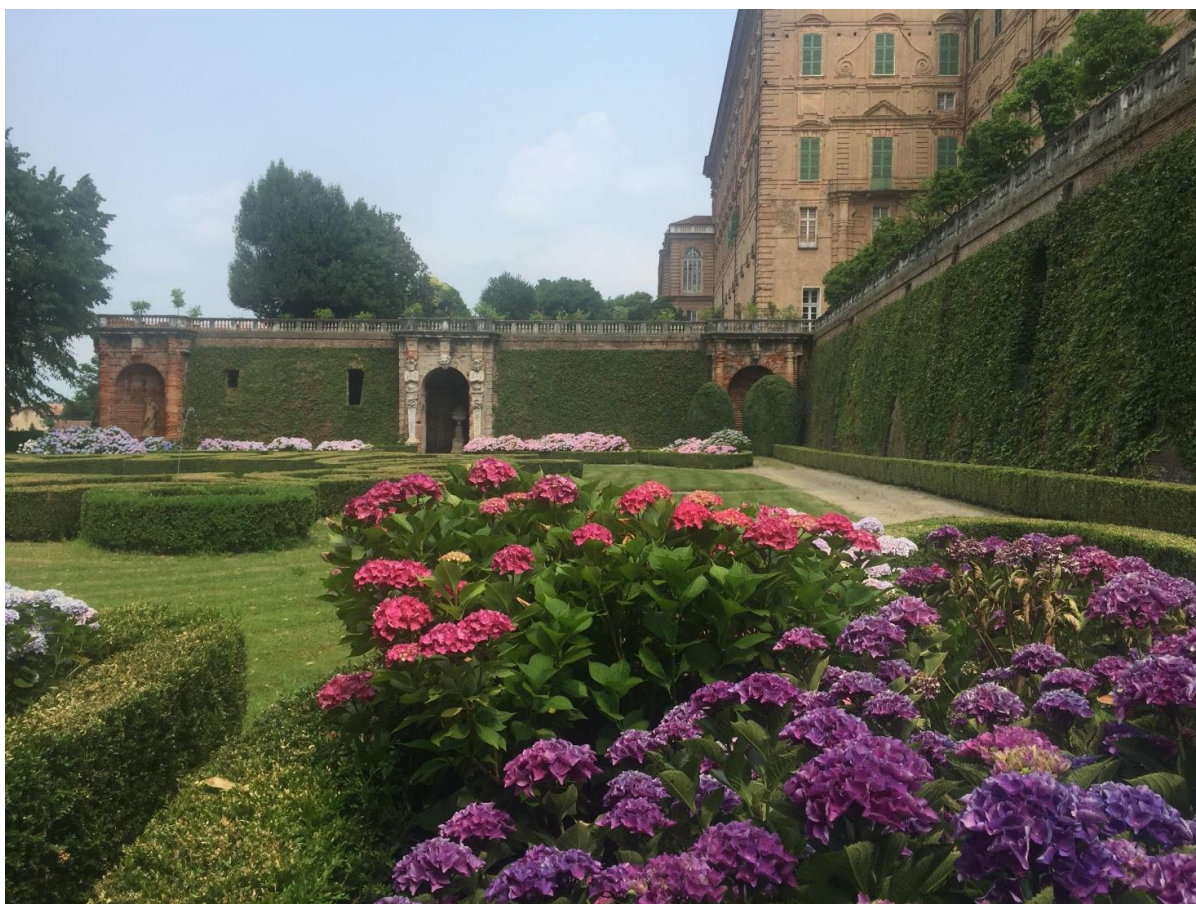
Photo 4) Agliè (Turin), castle (Amedeo di Castelmonte, 1646, Ignazio Renato di Borgaro, 1765), the garden and the grottoes

The castles of Agliè and Racconigi are now part of the system managed by the Regional Museums Directorate. The last of the cadets' residences, Govone Castle 39 , auctioned off by the Dukes of Genoa (a branch of the Savoy family) at the end of the 19th century, is now owned by that municipality, which strives to enhance its value notwithstanding the financial difficulties of a small municipality.