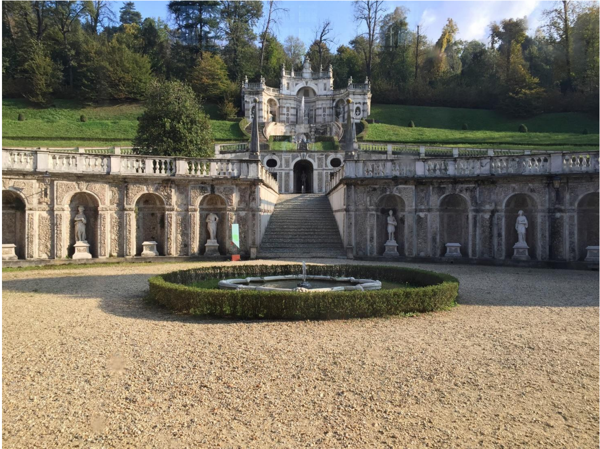
Photo 3) Turin, Queen's Villa (Ascanio Vitozzi, 1615), the garden (Creative Commons 3.0, 2017) 31

Regional Museums Directorate 29 (a peripheral structure of the national Ministry of Culture that manages some, not all, of the Savoy residences), where the apartment used by Prince Eugene of Savoy (more in Vienna and Budapest than in Turin) is the only one that has retained its original decorations undamaged, can be visited, and is, and the other is Museum of the Risorgimento 30 , which is mainly housed in the 19th-century wing of the palace. Built to house the Italian Parliament (Turin was the capital of Italy from 1861 to 1865), Palazzo Carignano was completed in 1871 when the capital had already been moved to Florence and then to Rome.