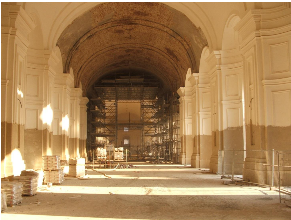
Photo 5) Venaria Reale (Turin), Castle. The Orangerie (Filippo Juvarra 1722) during restoration (photo Paolo Cornaglia, 2004)

racks, and the park was destroyed. Completely in ruins after 1945, the complex underwent a major restoration process starting in 1998, and was inaugurated in 2007, thanks to European, national and regional funds amounting to about 300 million euros 43 . The restoration projects were selected through competitions and carried out under the careful supervision of the Superintendency for Architectural Heritage. The works were monitored by a team composed of art historians, historians of architectures, architects, engineers, chemists, etc., who verified every step of the construction process at the site and provided precise historical knowledge of the artefacts.